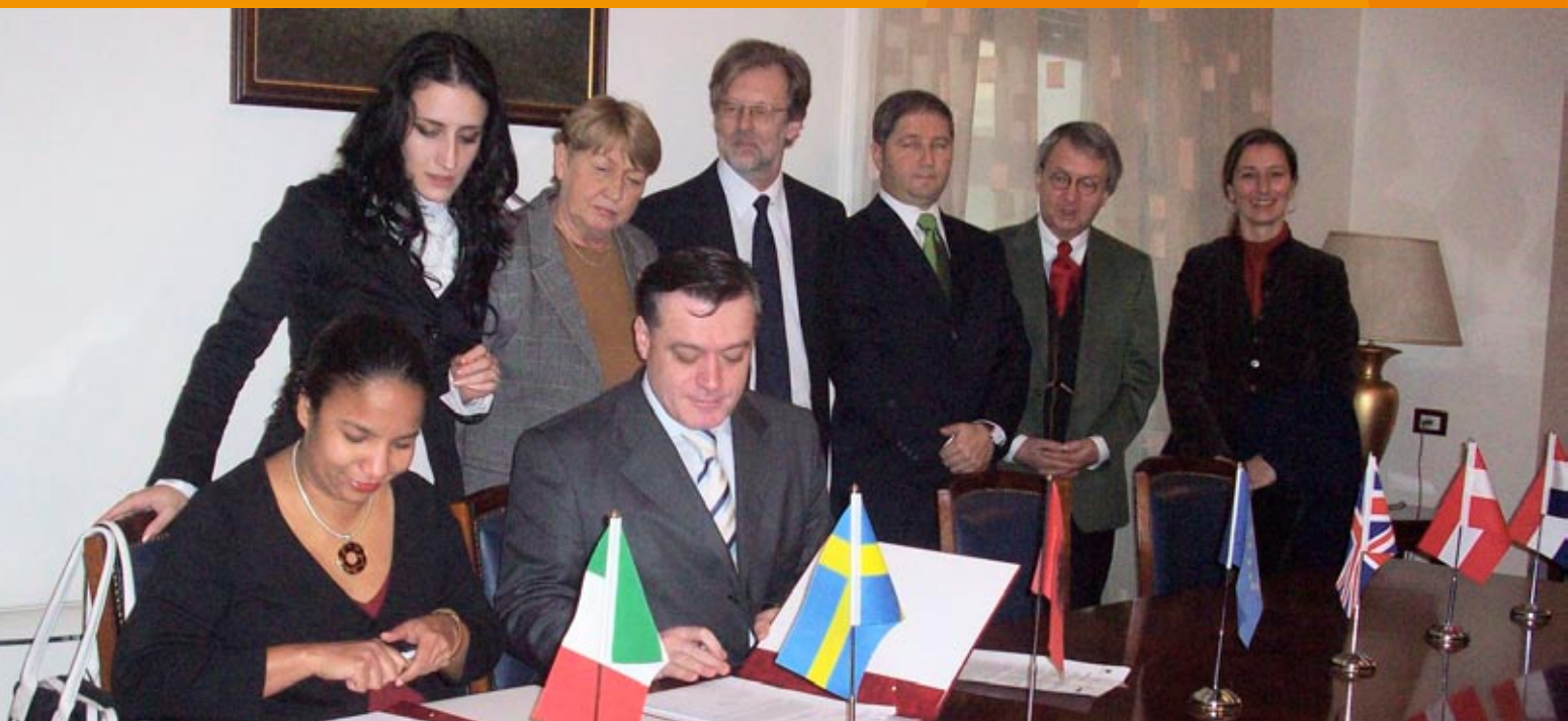
Photo: Minister of Finance Ridvan Bode and the World Bank Country Representative Camille Nuamah signing the Grant Agreement for the Multi Donor Trust Fund (MDTF)