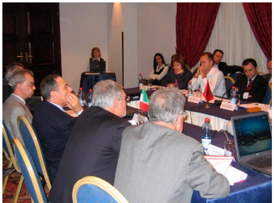
Photo: The first meeting of the Italo-Albanian Steering Committee established to co-ordinate the implementation of Italy-funded programmes in the energy sector.

both Italian and Albanian representatives. The first meeting was held at the presence of Minister Gene Ruli and of the Italian Ambassador, Saba d'Elia. In December 2007, a second meeting took place and further meetings are expected in early 2008.