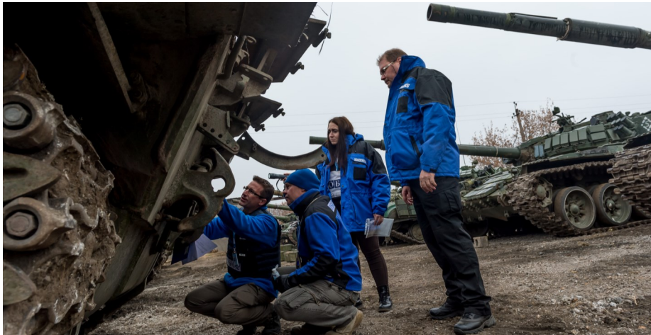
OSCE SMM monitors monitoring weapons withdrawal, November 2015.