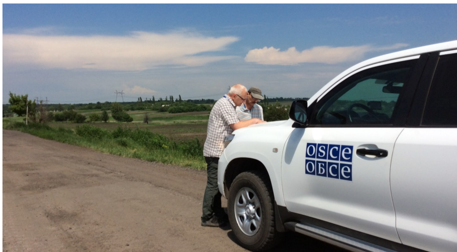
SMM monitors on patrol in eastern Ukraine, May 2015.