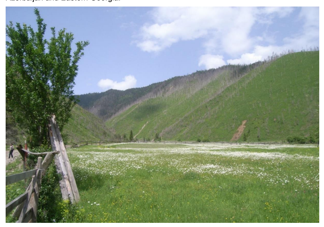
Landscape in the Daba village in the municipality of Borjomi, Georgia, after the 2008 wildfires. While the slopes show clear fire damage, the valley shows signs of natural restoration, which should be supported by reforestation efforts.

Looking ahead, this scoping study will serve as the basis for the project's next steps, which include consultations with a broader circle of stakeholders on joint activities, including cross-border co-operation, on landscape fire management and wildfire risk reduction in the pilot municipalities. Its results will inform the development of a strategic framework for co-operation and the implementation of pilot activities. These processes have the ultimate objective of reducing climate-related security risks and promoting climate resilience in North-west Azerbaijan and Eastern Georgia.