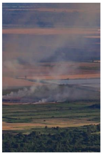
Kakheti. © Teimuraz Popiashvili

Situated in the Kakheti region in the eastern part of Georgia, Dedoplistskaro hosts the Vashlovani Protected Areas (VPAs), which consist of a nature reserve, a national park and three natural monuments with restricted access to the public. It also hosts the Chachuna and Iori Managed Reserves, which protect the banks of the Iori River. The municipality, mostly located between 500 and 800 metres above sea level, has a dry subtropical climate with hot dry summers and relatively cold winters. The area is prone to severe water shortages in the even of low levels in the Alazani and Iori rivers (UNDP, 2020).