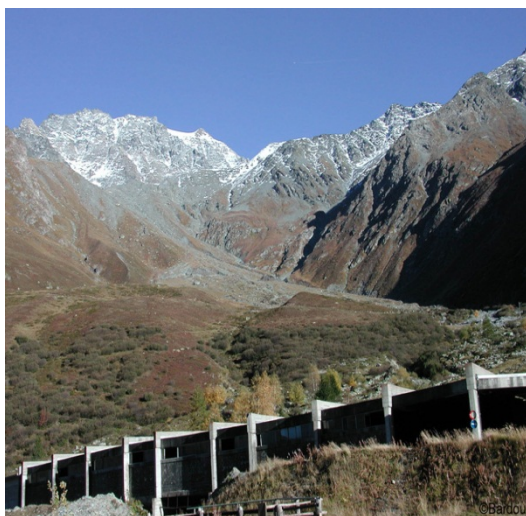
Transit route of the Grand-Saint-Bernard, Swiss side

The route of the Grand-Saint-Bernard over the Alps is a significant transit route linking Italy and Switzerland. It is part of the Via Francigena and had been used long before by the Romans as a road to the north. In mediaeval times the Via Francigena became an important trade and pilgrimage route. It has been designated a “Major Cultural Route of the Council of Europe”.