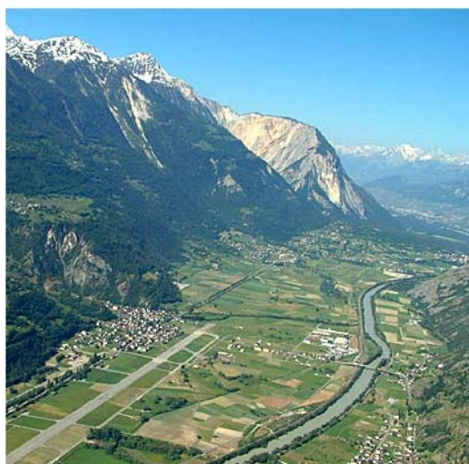
Floodplain of river Rhone, upper Rhone valley

The first reported natural hazard of Switzerland is the Tauredunum landslide on the river Rhone in 563 AD that had produced a wave of up to 16 meters high reaching lake Geneva. Depending the season, the volume of water conducted by the river Rhone varies significantly.