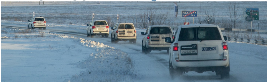
An SMM patrol near Makiivka, Donetsk region