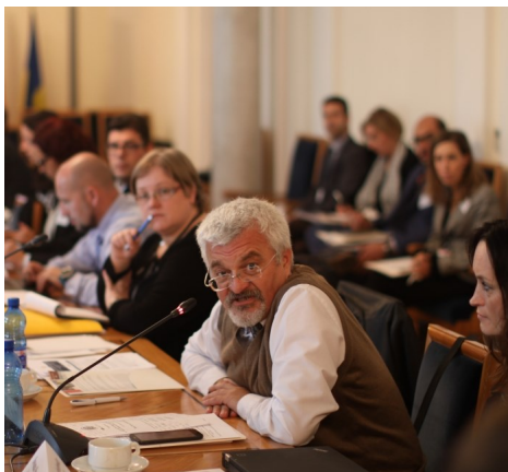
Vladimir Cucic, Serbian Commissioner for Refugees and Migration, speaks to participants of ODIHR's expert meeting on the Migration crisis in the OSCE region in Warsaw on 12 November.

The emergency situation of refugees in Europe was the focus of an expert panel meeting, organized by ODIHR on 12 and 13 November 2015 in Warsaw.