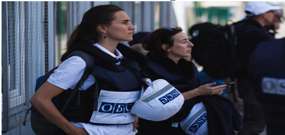
SMM staff members near Stanytsia Luhanska