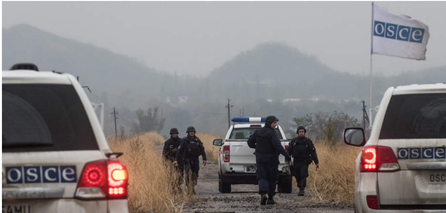
Demining near Marinka, Donetsk region