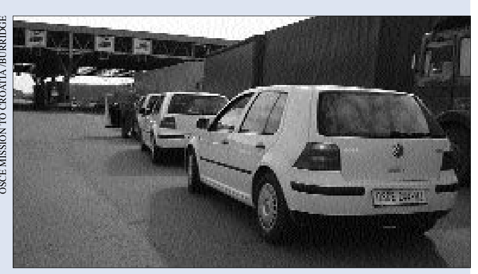
RAPID DEPLOYMENT: On 13 March, the second batch of four cars from the OSCE Mission to Croatia transited the Lipovac border crossing on their way to support the OSCE Mission to FRY in Belgrade. The cars, part of a total of 12 destined for the new Mission, are surplus to requirements since the OSCE Police Monitoring Group in the Danube region of Croatia ceased operations late last year.