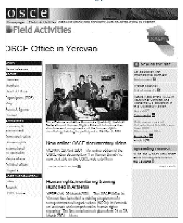
The OSCE Office in Yerevan is now accessible online