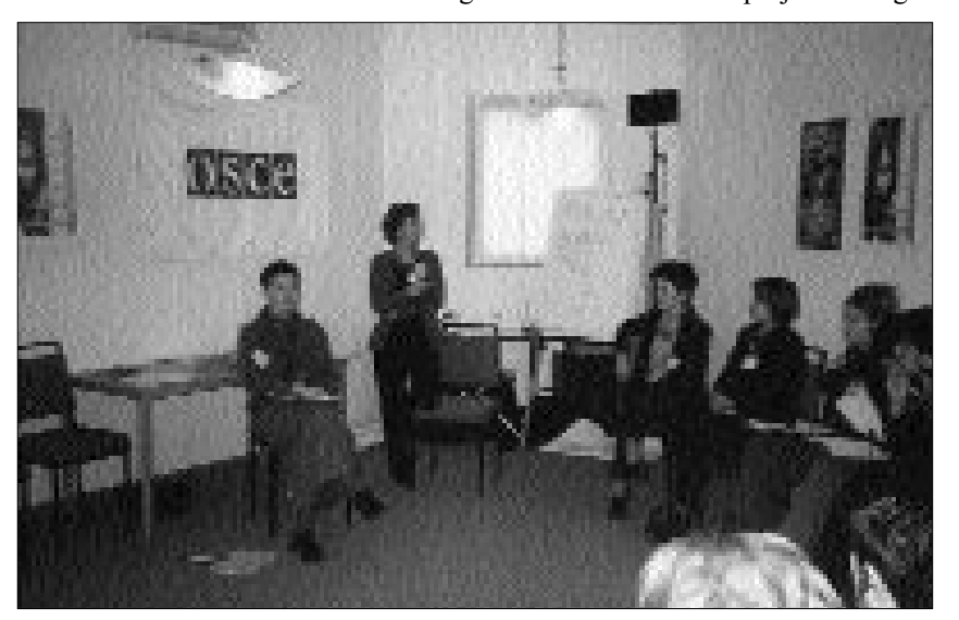
Participants at the ODIHR-funded WRATE gender seminar in Albania

Many of the participants were unaware of their rights and of the obli-