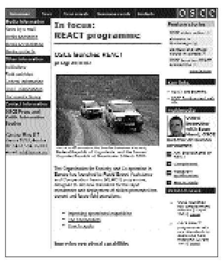
The web-enabled REACT system can be viewed on the OSCE website

Rigorous standards have been defined for the professional competence of staff at all levels. The fields of expertise are human rights, rule of law, democratization, elections, economic and environmental affairs, press and public information, media development, political affairs, administration and support (communications, information technology and information management, security, transporta-