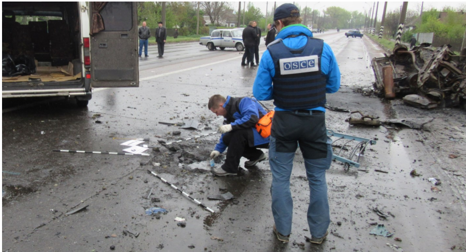
OSCE SMM monitors at the incident scene near Olenivka, April 2016.