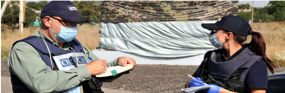
SMM monitoring officers in Donetsk region