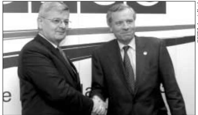
German Foreign Minister Joschka Fischer with Chairman-in-Office Jaap de Hoop Scheffer

said: “Adopting this document is an important first step in positioning the OSCE as a modern security organization capable of responding to changes in the overall security situation.”