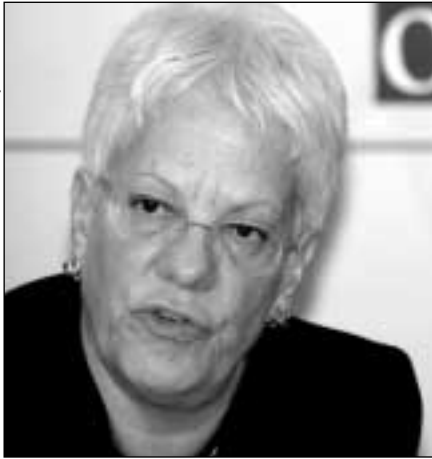
ICTY Chief Prosecutor Carla del Ponte

Confronting the past to heal the scars of conflict, however emotionally and politically painful, was the message of Carla del Ponte to the countries of the former Yugoslavia on 4 November. The Chief Prosecutor of the International Criminal Tribunal for the Former Yugoslavia (ICTY) suggested concrete ways in which the OSCE could further strengthen its co-operation with the Tribunal, especially in the field.