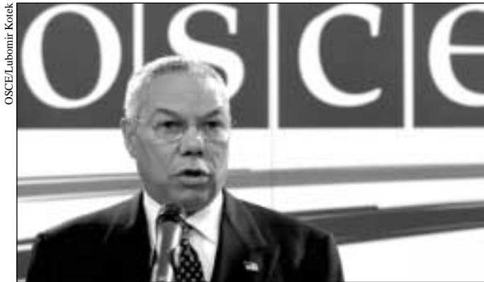
U.S. Secretary of State Colin Powell