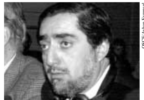
Afghan Foreign Minister Abdullah Abdullah

situation by the very fact that they are free. But simply feeling free is not enough. They need education, health services and job opportunities. In a country where education was once banned, there are now four million students, with girls comprising some 35 to 40 per cent of the total.