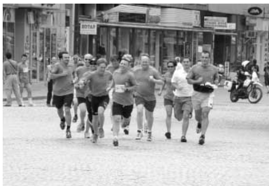
OSCE/Spillover Monitor Mission to Skopje