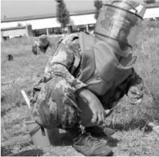
De-mining with the use of a special probe