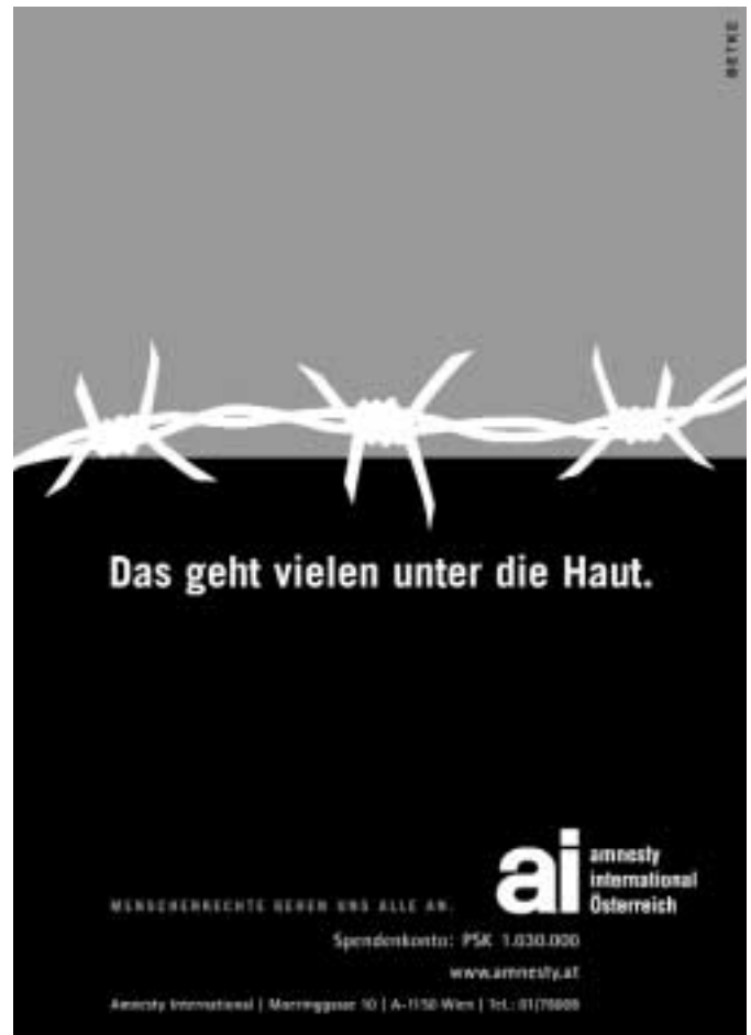
“It really gets under the skin”: an Amnesty International campaign against torture

“Yes, these technical discussions are important, but we