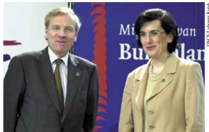
2003 OSCE Chairman-in-Office Jaap de Hoop Scheffer with Acting Georgian President Nino Burjanadze

In a packed, windowless basement room in the Maastricht conference centre, he chaired a meeting of interested countries which resembled a cross between a public auction and the Eurovision Song Contest, with ministers greeted by cheering and applause as they announced how much their country would donate.