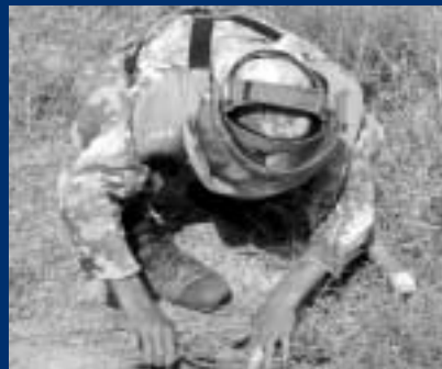
De-mining requires considerable patience and expertise.

role in co-ordinating the roles of its various partners, the OSCE Centre in Dushanbe is helping Tajikistan implement its commitments under the Ottawa Convention, the comprehensive framework for addressing the global landmine problem.