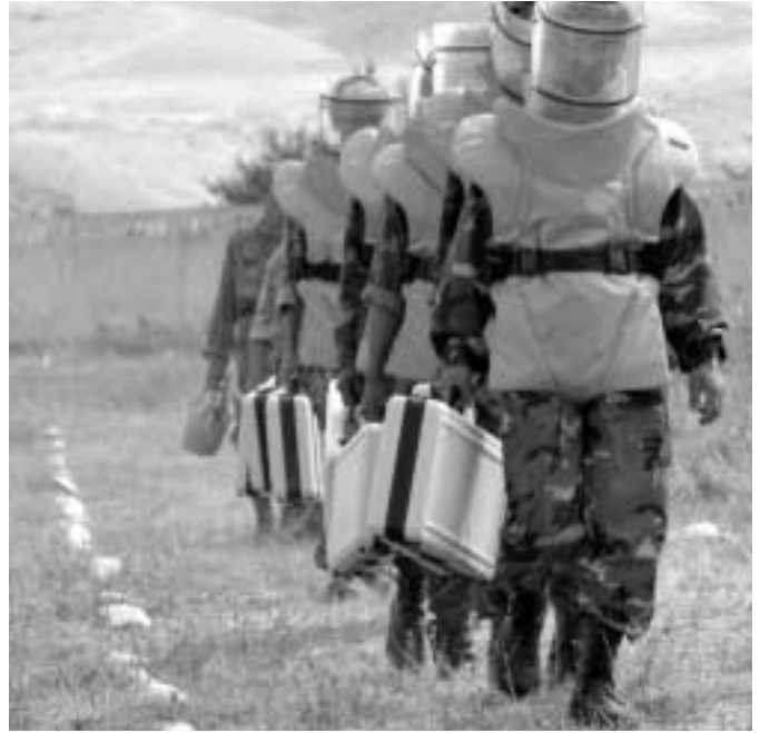
De-mining team on its way to a training site