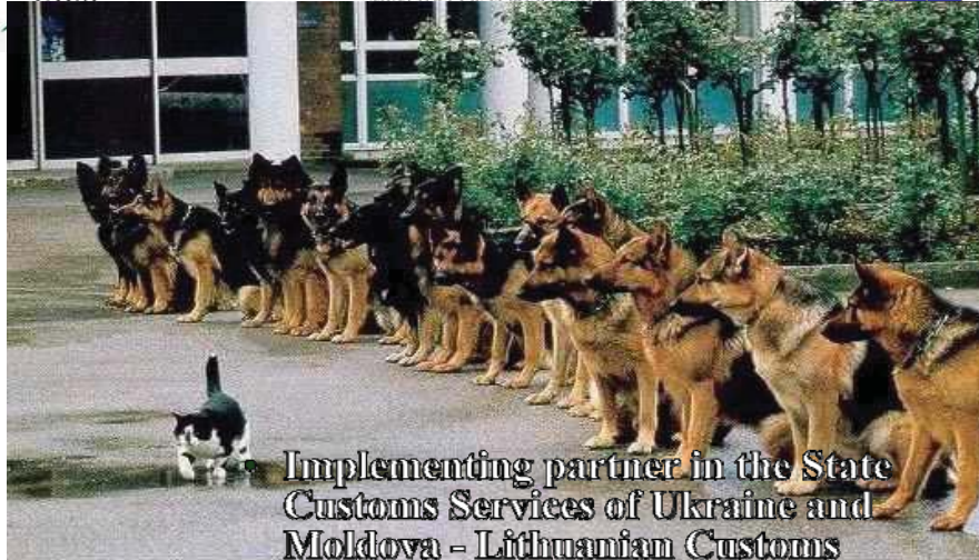
Implementing partner in the State Customs Services of Ukraine and Moldova - Lithuanian Customs