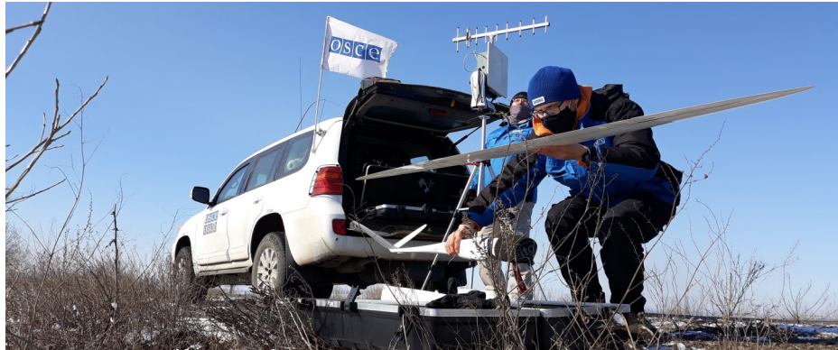
SMM monitoring officers preparing to launch a UAV near Hnutove, Donetsk region