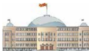
The Assembly of the Republic of North Macedonia

Manual for Members of Parliament and Parliamentary Staff on Gender Equality and Women's Empowerment