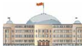
The Assembly of the Republic of North Macedonia