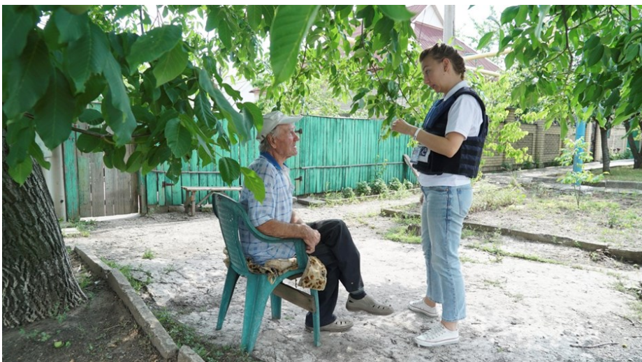
An SMM staff member speaks with a local resident of Yasynuvata, Donetsk region.