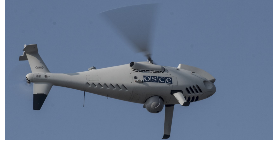
An SMM long-range unmanned aerial vehicle.