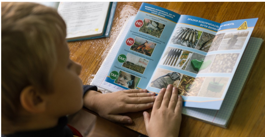
OSCE SMM monitors in Donetsk region visited a school in Oleksandrivka and handed over unexploded ordnances awareness leaflets to children, 5 October 2015.