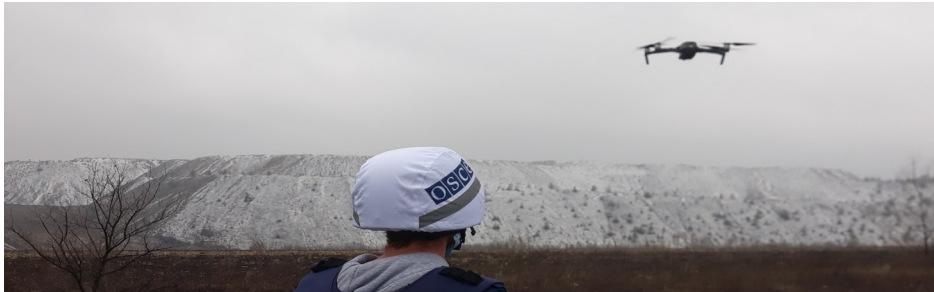
SMM patrolling near Severodonetsk, Luhansk region