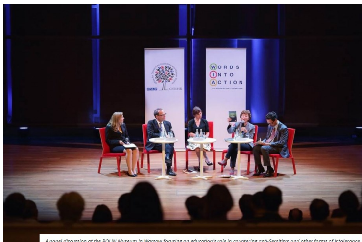
A panel discussion at the POLIN Museum in Warsaw focusing on education's role in countering anti-Semitism and other forms of intolerance, 28 September 2016. The discussion was organized as a side event during the Human Dimension Implementation Meeting (HDIM).

ODIHR unveiled a project focused on addressing the security needs of Jewish communities, fostering coalition building among different communities, and countering anti-Semitism through education, at an event in Warsaw on 28 September 2016.