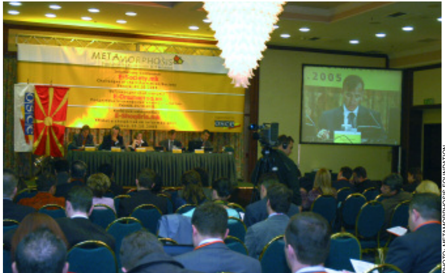
The international e-society conference opens in Skopje

Four more technical round tables followed the main conference, each focusing on a different issue: e-government, e-media and freedom of the media on the Internet, e-education and the prevention of cyber crimes. Three of these were conducted outside of Skopje, in Tetovo, Ohrid and Bitola in order to make the public outside the capital also aware of e-society issues. During the roundtable discussion