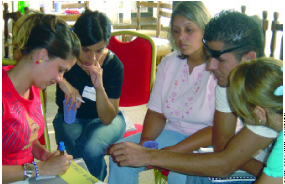
Young Roma leaders work together in a team building exercise