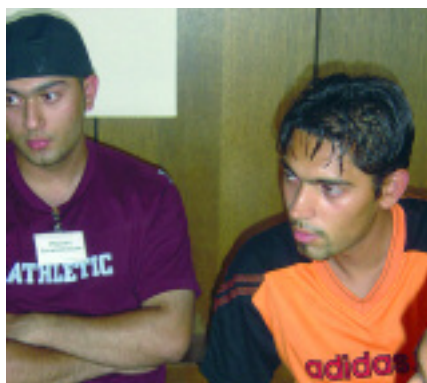
Participants in the leadership training absorb new knowledge