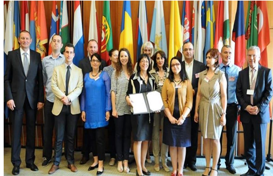
Signing ceremony of SEE Aarhus centers in Vienna, 3 June 2015/ Annual Aarhus meeting.