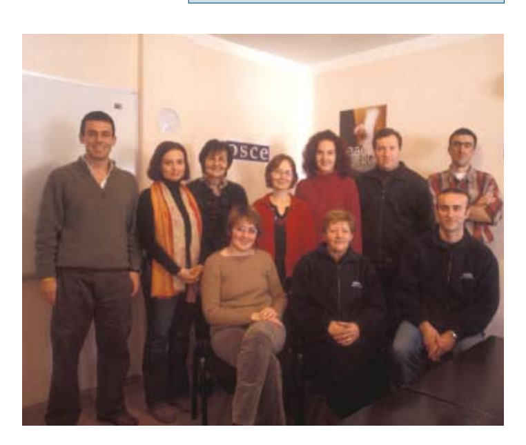
elenta Field Office Gospić team, November 2005