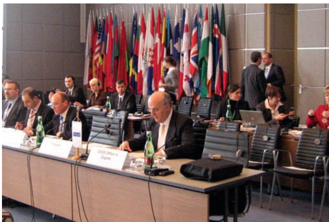
HoO presented his report to the OSCE Permanent Council in Vienna, 5-6 March 2008.