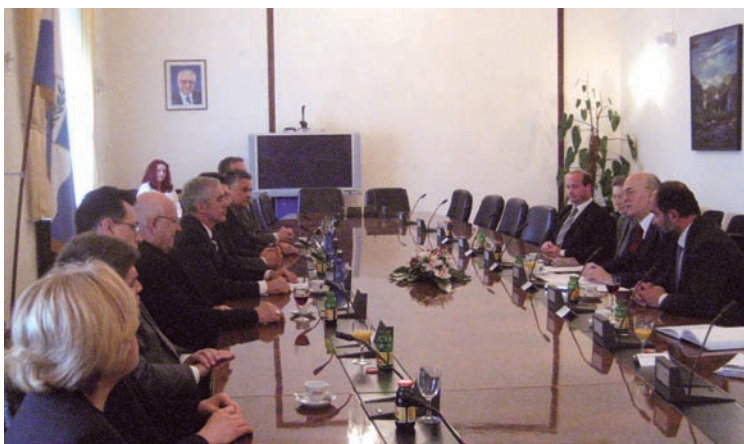
Ambassador Fuentes attended the Official closure of Field Office in Zadar and met with the Archbishop of Zadar, Msgr. Ivan Prenda, Zadar County Prefect, Stipe Zrilić and Mayor of Zadar, Živko Kolega in Zadar, 27 March 2008.