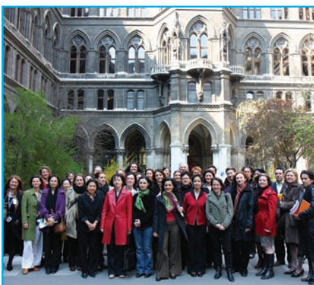
Meeting of Focal Points for Gender issues in Vienna's Hofburg Palace.

At the beginning of its term of office, the present Finnish Chairmanship of the OSCE announced its dedication to focus on three questions related to human rights: combating trafficking in human beings, promoting tolerance and non-discrimination, in particular with regard to the Roma and Sinti people and gender mainstreaming in all OSCE activities. All of these areas relate to the core task of the OSCE to promote respect for human rights and fundamental freedoms of all citizens in the OSCE area.