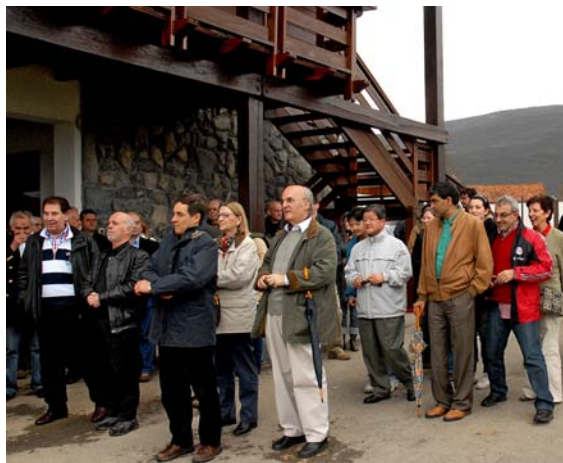
Diplomatic outing to Lika sponsored by the President and Mrs. Mesić, Lika County, 12 April 2008.