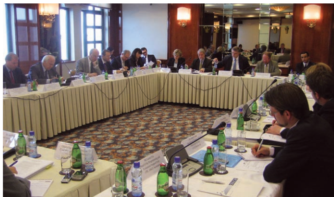
SE Europe Heads of Mission Meeting held in Vršac (Serbia), 22 April 2008.