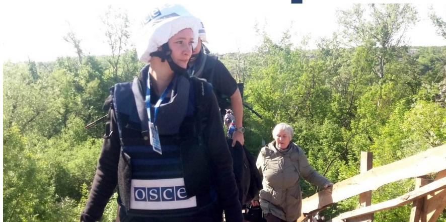
OSCE SMM monitors with local residents at Stanytsia Luhanska bridge, 13 May 2017