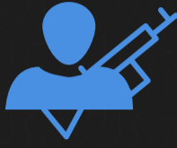
FOREIGN TERRORIST FIGHTERS

States across the OSCE area face a worrying and growing threat from the movement of foreign terrorist fighters, traffickers and criminals who are using fraudulent passports to travel undetected.