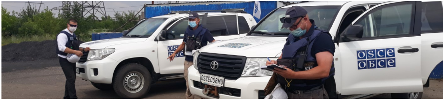
Monitoring officers in the vicinity of the disengagement area near Zolote in Luhansk region