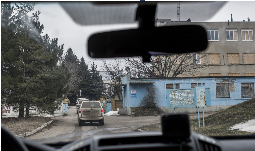
The OSCE SMM on patrol at Donetsk Filtration Station, 2018.