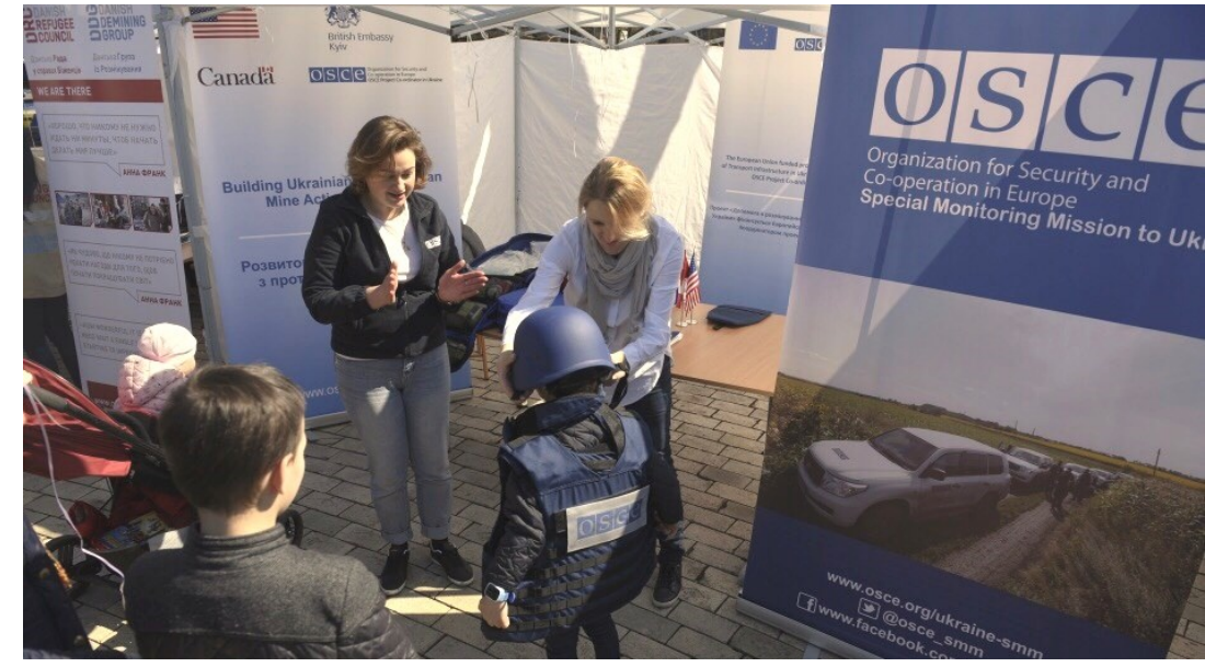
The staffs of OSCE Special Monitoring Mission to Ukraine and OSCE Project Co-ordinator in Ukraine demonstrate demining equipment during Mine Awareness Day, Kyiv, 4 April.