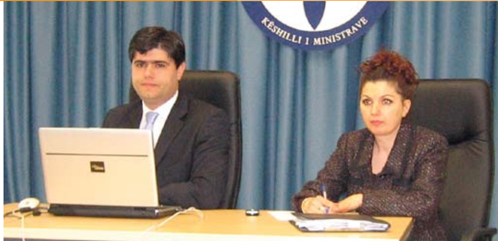
Photo: Consultation process of Crosscutting Strategy on Information Society

On 20 January 2009, the Development Cooperation Office of the Italian Embassy in Tirana and the Ministry of Economy, Trade and Energy held a conference in Tirana to launch the Italian-Albanian Programme for the Development of SMEs. Funded by the Italian Government with a total amount of 30 Million Euros, it aims to contribute to the economical and social growth of Albania, facilitating the access to the credit system of the Albanian SMEs. The programme includes three main components: 25 million Euros as a soft loan for a Credit Line in favour of