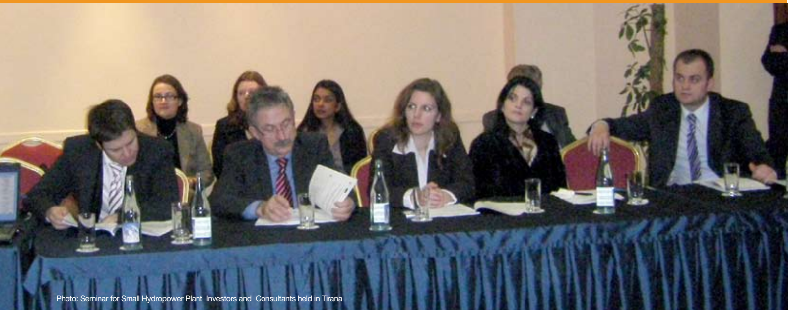
Photo: Seminar for Small Hydropower Plant Investors and Consultants held in Tirana