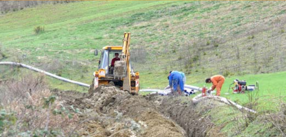
Photo: The ongoing project of the TIKKA Tirana Project Coordination Office for the reconstruction of water pipe system in 6 villages of Kavaja.

maintain distribution of clean water; the rehabilitation of a kindergarten in Berat; and equipment with medical devices for the regional blood bank in Vlora. Some 500,000 Euro have already been reserved for these projects.