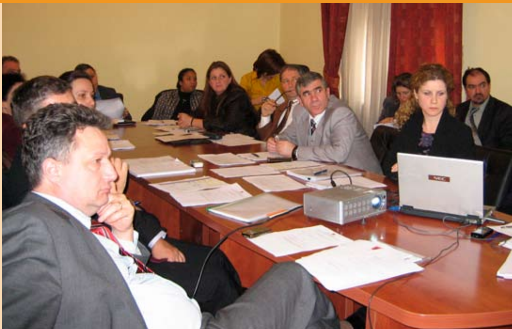
Photo: IPS SG meeting held on 30 January 2009

The DSDC issued at the end of December the 2006-2007 NSDI Progress Report. The Report was prepared in co-operation with the line ministries and other main state institutions based on high level indicators defined in the NSDI, focusing on progress achieved so far, especially on priorities in the framework of NATO and European Integration. The report is a key component of the monitoring system for the implementation of IPS. It also includes an evaluation of progress made toward reaching Millennium Development Goals as well as the further steps that need to be undertaken. The draft was consulted with civil society and donor community in November 2008 and the final report reflects the feedback that has been received. The DSDC will make available printed copies of the Report to all interested stakeholders. An electronic version can be found at www.km.gov.al .