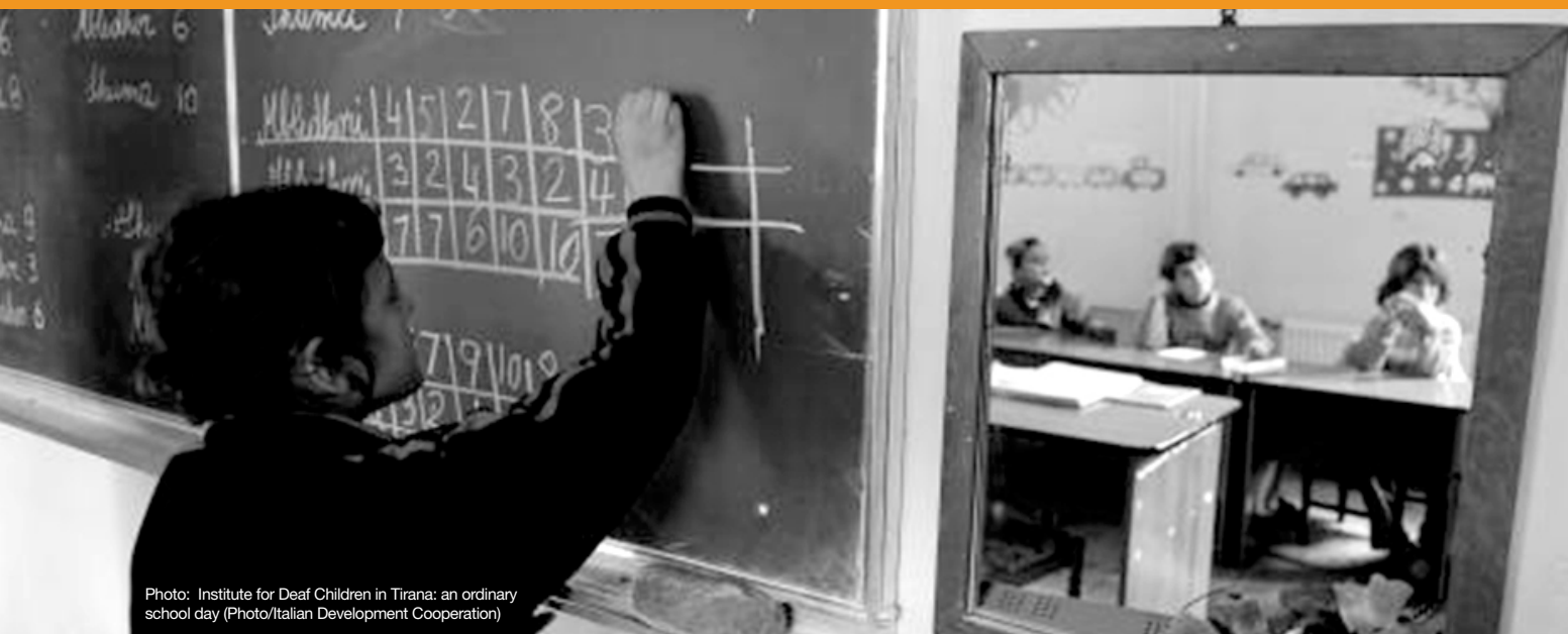
Photo: Institute for Deaf Children in Tirana: an ordinary school day