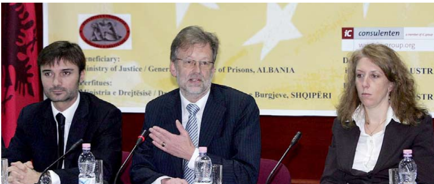
Photo: The project Design of Prisons and Pre-Trial Detention Centres, financed by the EU with 780,000 Euro, presented on 23 January 2009.

mistreatment as well as inappropriate handling of conflicts in prisons are all reflected into a country's general human rights record and standing. Prisons must not only serve temporary punitive purposes. They should also prepare a safe return of detainees to society. Therefore, respect for human rights is of extreme importance in the prison environment."