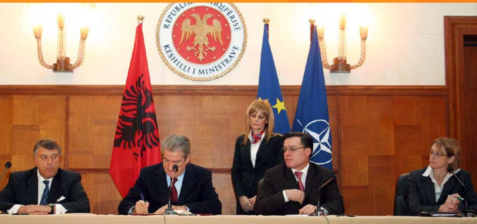
Photo: Prime Minister Berisha during the signing of the letter of understanding for the ratification of the 6th and final review of the 3 year agreement with IMF on 8 January 2009