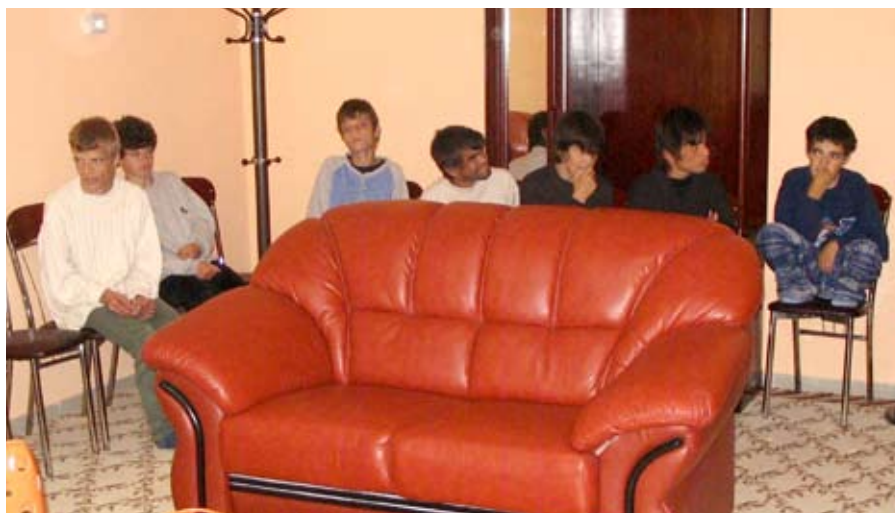
Photo: The Centre for the Mentally Disabled Children in Berat rehabilitated with financial support by TIKA Tirana Project Coordination Office in November 2008

On 30 January 2009, the Inter-ministerial Working Group on the Crosscutting Strategy on Prevention and Fight against Corruption and Transparent Governance (2008-2013) held its first meeting of the year to seek approval for the updated integrated action plan of the strategy for 2009. The meeting was chaired by the Deputy Prime Minister, Genc Pollo and attended by all Deputy Ministers. The integrated 2009 Action Plan has been prepared based on the action