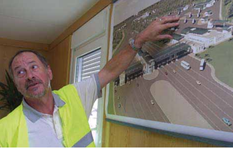
EGZ ZESTIC-FONET NEWS AGENCY