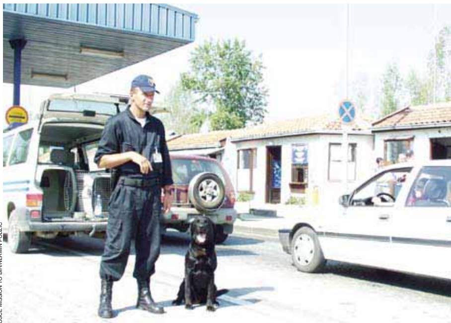
OSCE MISSION TO BIAHARIN POZJIC

And of course an essential assistance route is through our OSCE field missions and operations. [See pages 12 and 13.]