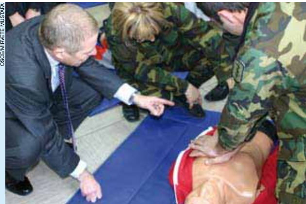
Skopje, January 2006: Mountain border police are taught emergency first-aid.

The Concept is also designed to strengthen the capability of the Organization to tackle threats stemming from outside the OSCE area