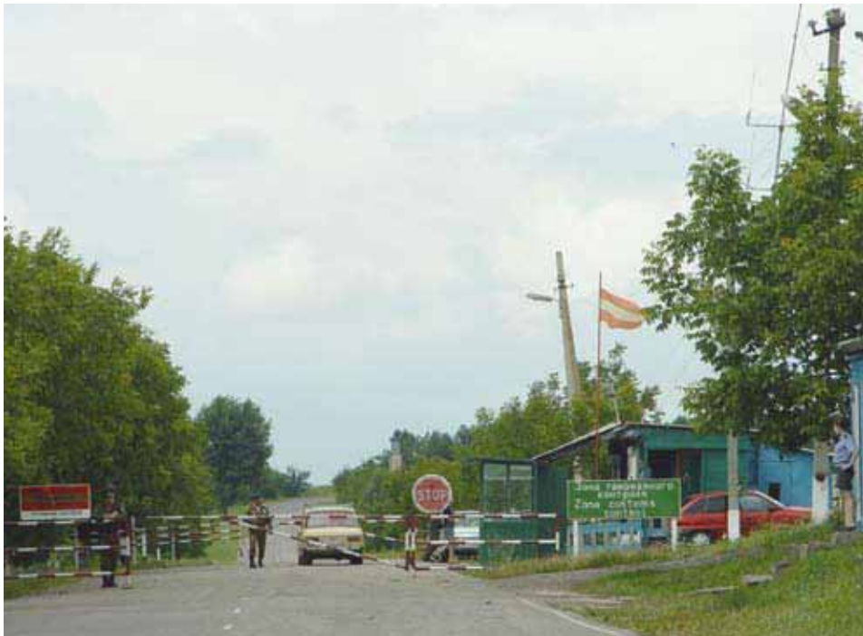
Moldovan-Ukrainian border crossing point, summer 2005. The international border at Khristovaya is controlled by Transnistrian authorities. The OSCE Mission patrols the Transnistrian region regularly and shares information with the EU BAM.