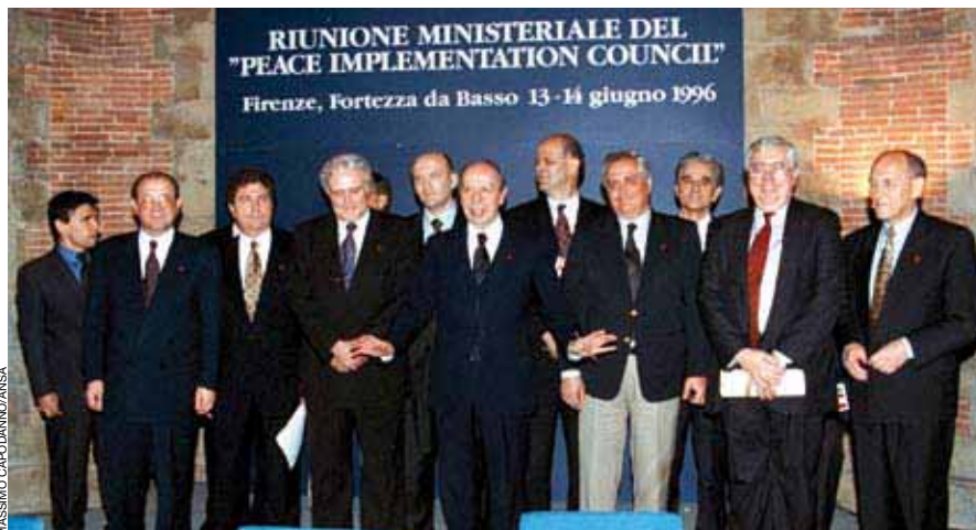
14 June 1996. Italian Foreign Minister Lamberto Dini (centre) and (to his right) the OSCE Chairman-in-Office, Swiss Foreign Minister Flavio Cotti, with the signatories to the Florence Agreement and other dignitaries.