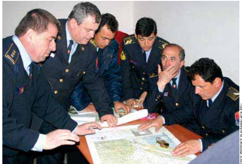
Lezha, Albania, April 2006. Albanian border and migration police improve their skills in map-reading.

trafficking in human beings by emphasizing the importance of a pre-screening system; and