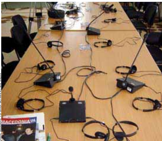
New translation equipment, courtesy of the OSCE, is facilitating dialogue in the multilingual municipality of Cucer Sandevo.

The fact that the Mission has been hosted by Skopje since September 1992, making it the Organization’s longest-serving field presence, is proving especially useful in decentralization efforts. Backed by extensive experience and expertise on the ground, the OSCE is able to offer a broad range of technical support especially tailored to a municipality’s specific needs and aspirations.