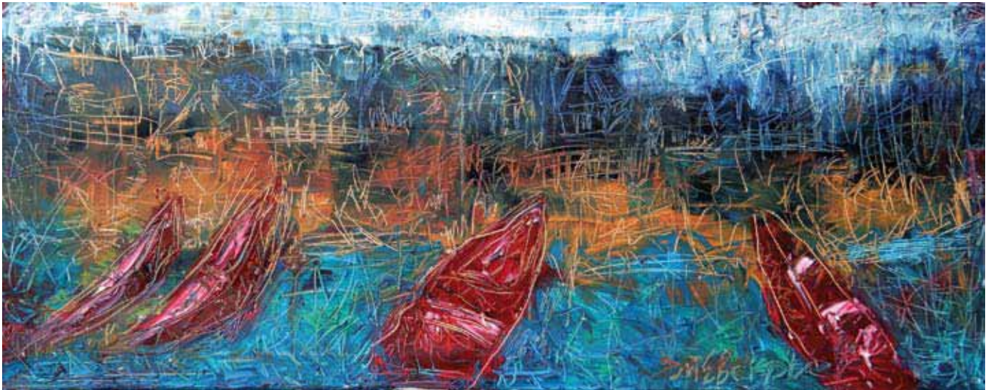
Village Boats, oil on canvas, 2006