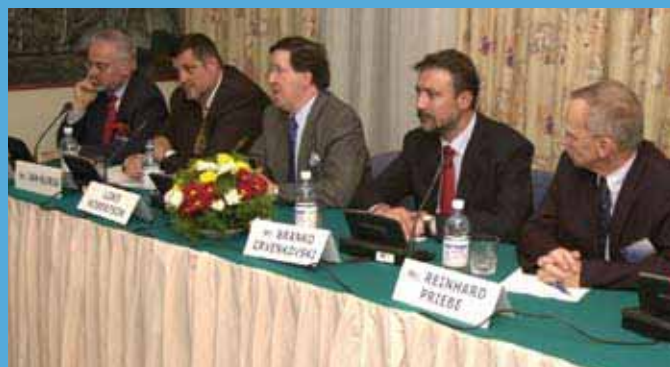
NATO HQ SKOPJE PHOTO

The participating countries reaffirmed the principle of regional ownership, with their four international partners offering to give strong support to their efforts. The OSCE's contribution was to focus on