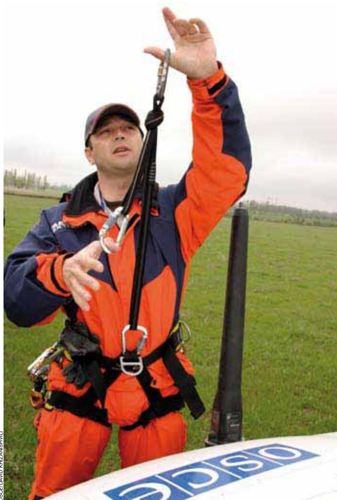
Georgia, April 2006. Training for border guards includes helicopter search-and-rescue operations in mountainous areas.