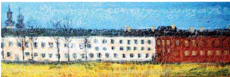
Sunday Afternoon Stroll, oil on canvas, 2006