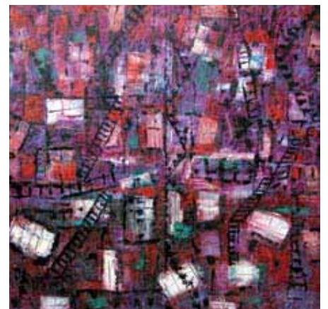
The Fire Escape, oil on canvas, 2006