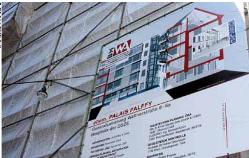
Wallnerstrasse No. 6 is getting a massive facelift.