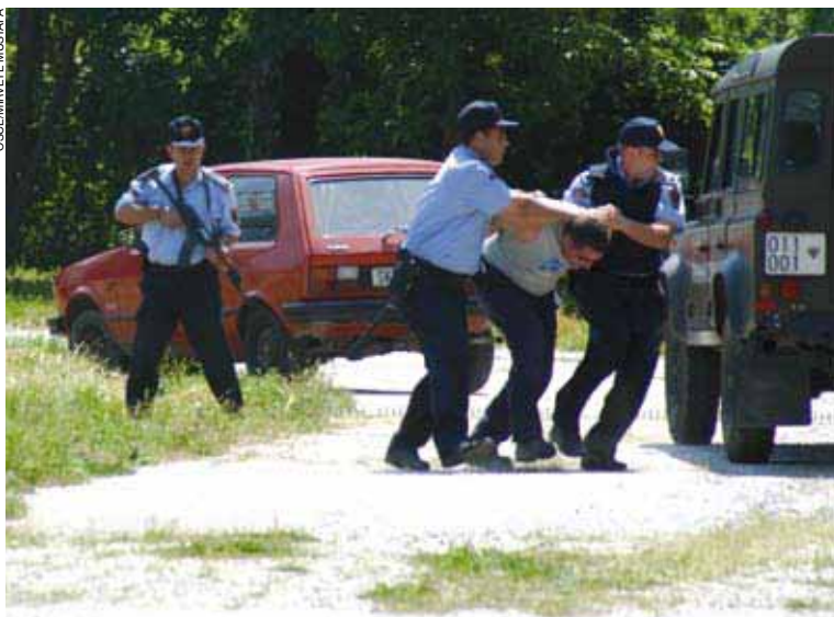
Skopje, May 2006. Border police simulate real-life situations to improve their response capability.