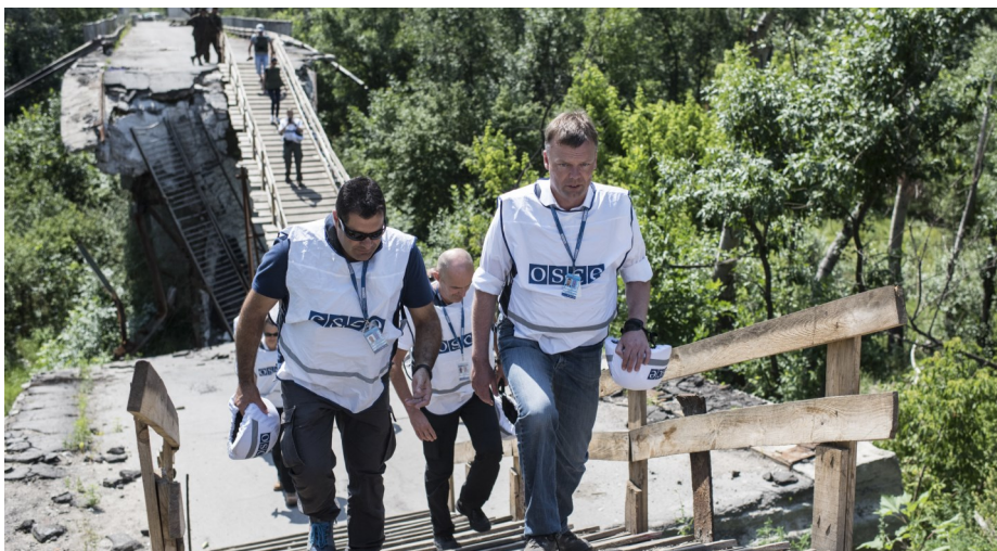
SMM monitors assessed the situation at the bridge in Stanytsia Luhanska, July 2015.