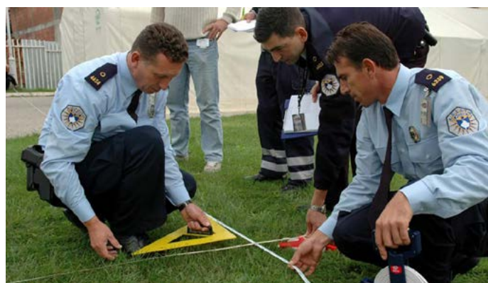
Crime scene investigation courses aim to enhance the capabilities of the police.