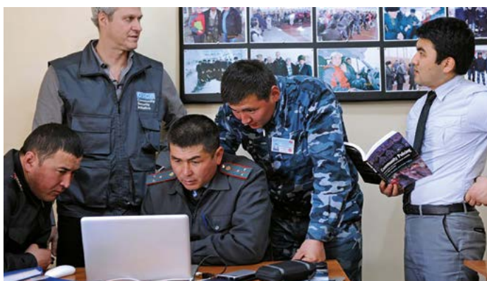
The SPMU focuses on implementing sustainable projects such as the education of police officers, prosecutors, judges and defence lawyers.