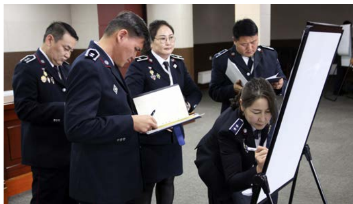
The SPMU supports OSCE field operations in their work to strengthen the basic training of police.