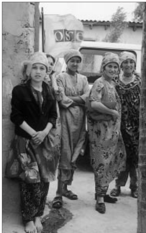
Women in Tajikistan

Apart from these external aspects of the OSCE's work, the Secretariat will continue to monitor opportunities for women within the OSCE. The Organization's structure should reflect external standards and thus gradually show an improved gender balance in staffing. Today 24% of the OSCE's staff are women. Particular attention will have to be given to this issue by seconding States, because in the past, out of 4023 staff deployed in the field, 568 were women (14%).