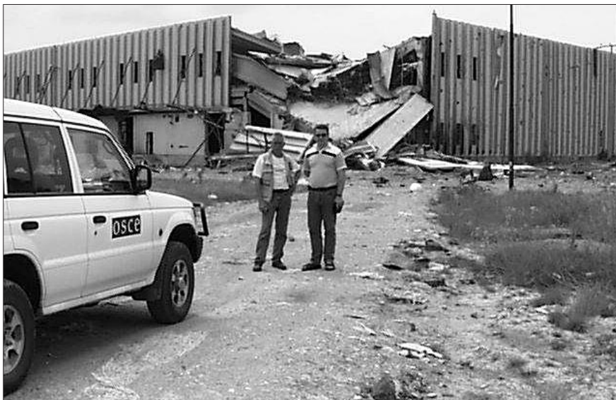
Assessment Team members in front of a warehouse previously used by the Kosovo Verification Mission

For up-to-date information regarding the new OSCE Mission in Kosovo please visit the OSCE Website at www.osce.org