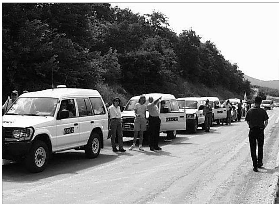
The OSCE Assessment Team on the way to Priština

On 14 June, 48 hours after KFOR entered Kosovo, an OSCE Assessment Team of 13 members and 5 vehicles arrived in Priština. The Assessment Team was part of the OSCE Transitional Task Force for Kosovo, established to prepare for a new OSCE mission in Kosovo. The principal goal of the Assessment Team was to assess the situation on the ground, and particularly the damage to buildings previously occupied by the OSCE Kosovo Verification Mission and whether or not these could be used for a new mission.