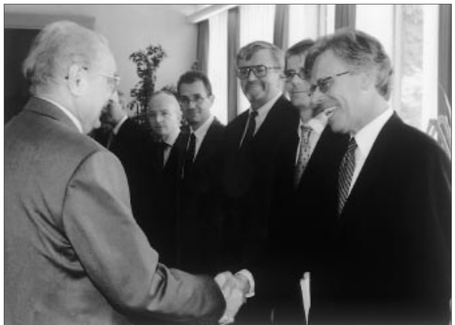
Mr. Knut Vollebæk (right) with Croatian President, Mr. Franjo Tudjman (left)