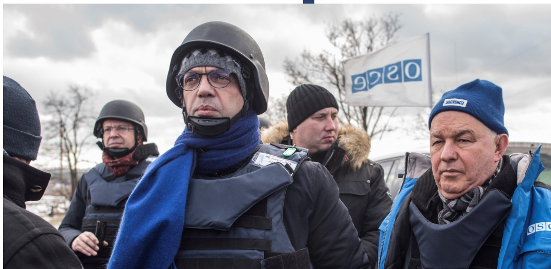
OSCE Chairperson-in-Office Angelino Alfano (l) and OSCE SMM Chief Monitor Ertugrul Apakan close to the entry-exit checkpoint near government-controlled Pyschchevyk, eastern Ukraine, 31 January 2018.