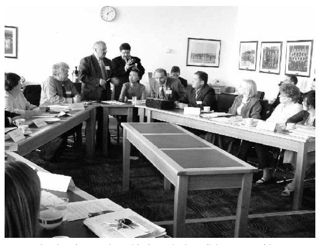
(During the meeting with the "District Policing Partnership" Cooperation between Police and citizens)

The study tour included several components including the following: understanding the modern tools of community policing; the practical meaning of "Protection of Human Rights" in day-to-day police work and civilian monitoring. The Kyrgyz officers also attended the meeting of the District Policing Partnerships Programme in order to see how cooperation between police and citizens can be established.