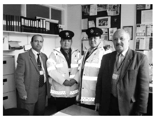
(Kyrgyz participants of the study tour)

From 2nd to 10th July, a team of the Kyrgyz police officers went on a study tour to Northern Ireland within the framework of the Community Policing Project operating in Kyrgyzstan under the OSCE Police Assistance Programme. The police officers visited the Northern Ireland Police Service to see community policing in practice, and establish close working contacts with their colleagues in order to gain new skills and knowledge. They also aimed to share experience and maintain international co-operation in the field of community policing.