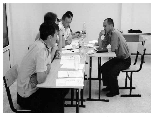
(During the examination upon the completion of training courses)

Certificates entitling holders to participate independently in crime scene examinations in the capacity of forensic experts, together with OSCE certificates, were granted to all participants. Subject and lecture plans on the "Theory of forensic examination", and a reference manual on "Methods of fingerprinting corpses" have been developed. An educational and practical manual on "Crime scene examination" is also being developed for police officers, and new training courses are being prepared.