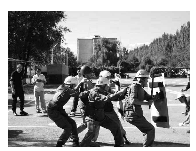
(Public disorder management training at the Police Academy in Bishkek)