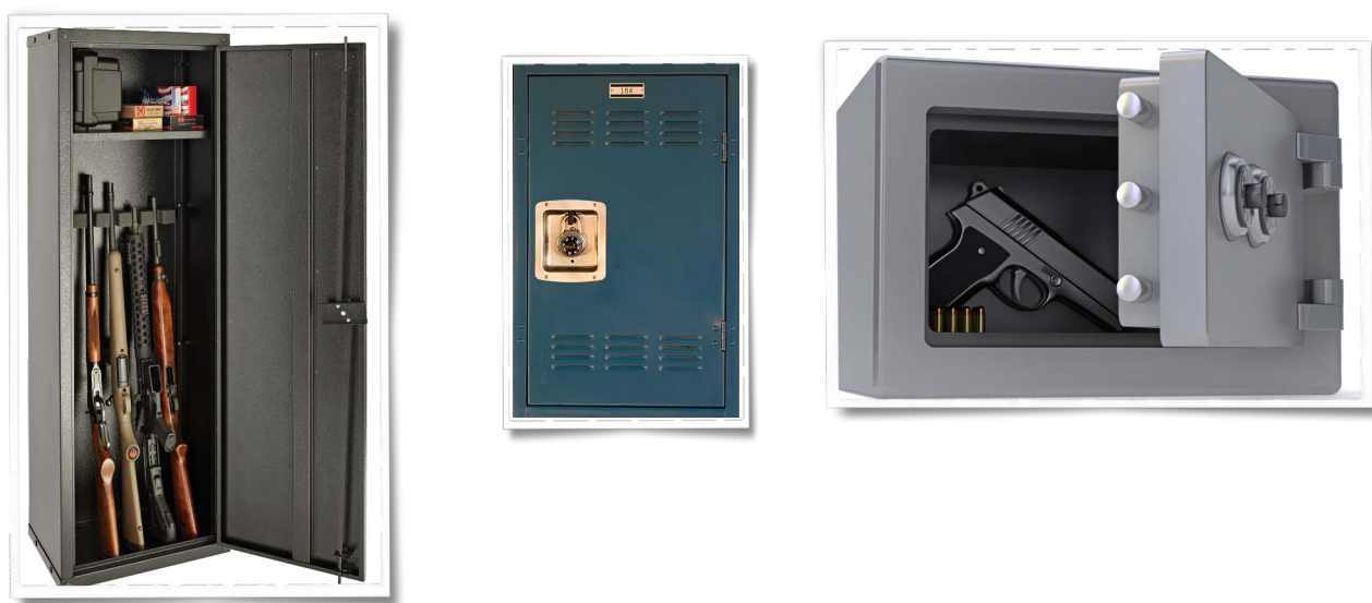
Cabinets for individual storage of weapons

The competent manager of the organizational unit controls the way of keeping SALW and the implementation of prescribed procedures. A written note is drawn up about the situation established during the control.