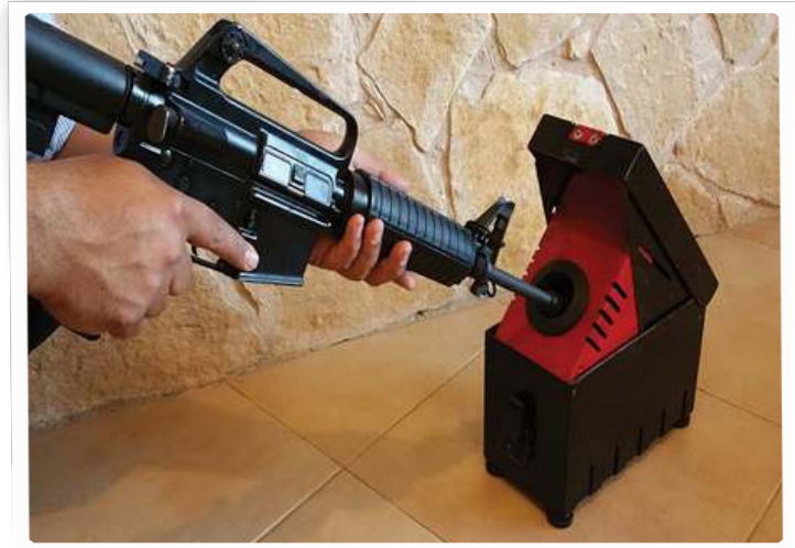
Figures 14 and 15: Display of the device for security check of weapons