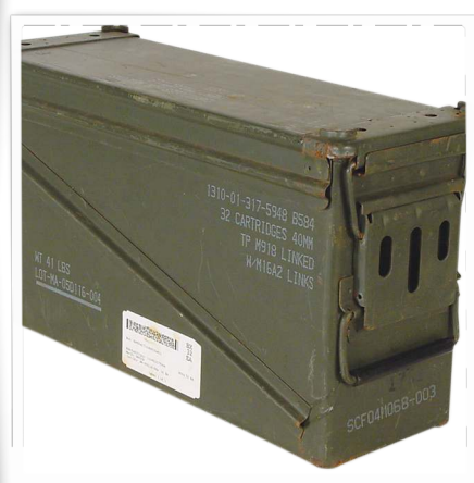
Method of group storage of weapons that are not on duty