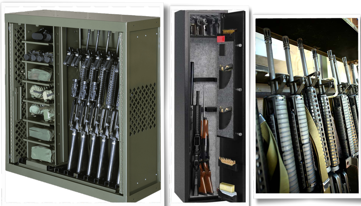
Ways of group storage of weapons

If there are two or more different organizational units in the same facility, the head of the organizational unit to which the SALW storage room belongs can approve the storage of SALW of another organizational unit in the same SALW storage room, but the SALW of those two organizational units must be visibly separated, with markings indicating the respective organizational unit. The head of the organizational unit to which the SALW storage room belongs is responsible for all SALW located in the SALW storage room.