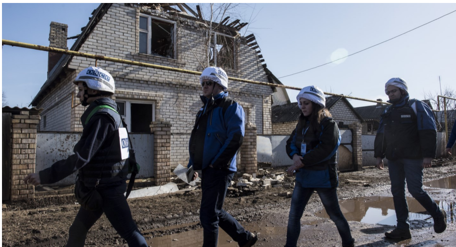
OSCE SMM monitors conducting a foot patrol in eastern Ukraine.