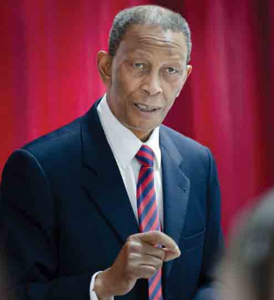
Judge Bakone Justice Moloto of the International Criminal Tribunal for the former Yugoslavia speaking at a training session for judges, prosecutors, and defence lawyers from across Bosnia and Herzegovina as part of the War Crimes Justice Project, Sarajevo, 17 March 2011.

demonstrations in Minsk following the presidential election on 19 December 2010. The Belarus trial-monitoring report, published in November, includes recommendations to address identified shortcomings, and the Office remains ready to discuss its findings and recommendations with the Belarusian authorities.