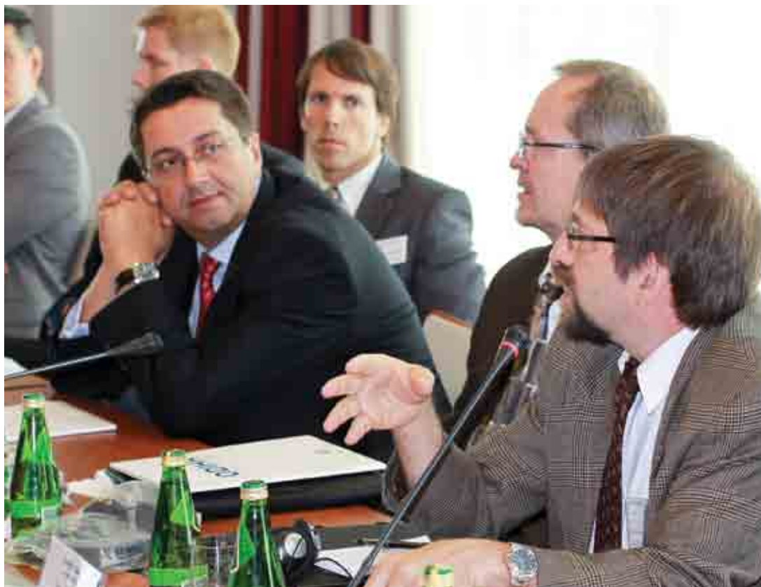
Participants at a seminar on increasing the accuracy of voter registers, Warsaw, 31 August 2011.