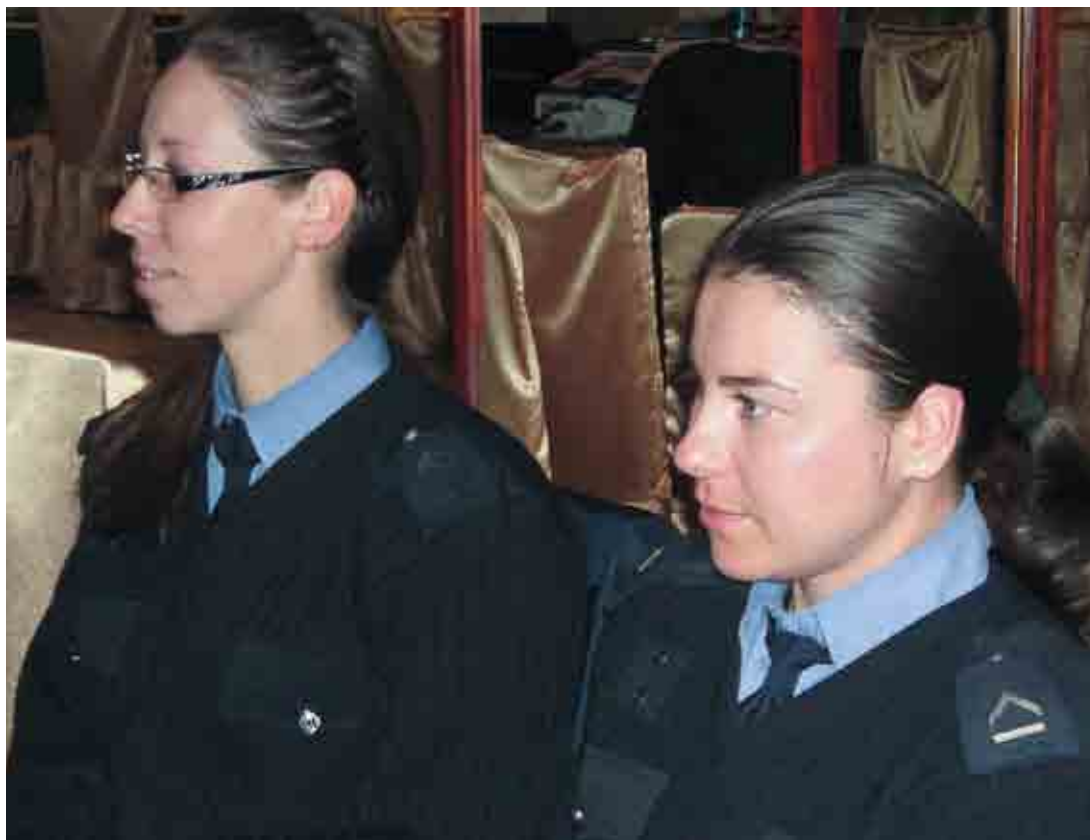
Law-enforcement officers participating at a training session in Zaječar, Serbia, on increasing awareness of women's security issues at the local level, 10 November 2011.