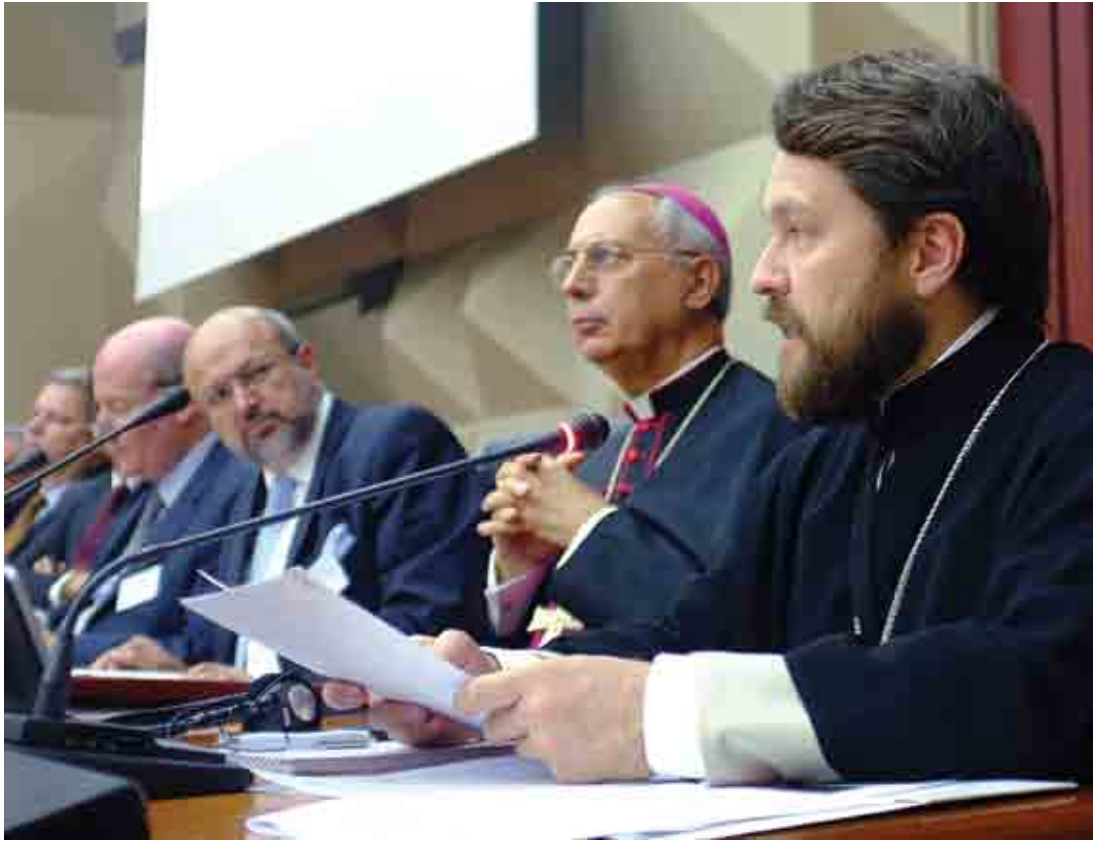
Metropolitan Hilarion of Volokolamsk addresses the opening session of an OSCE meeting on combating hate crimes against Christians, Rome, 12 September 2011.

Vienna. The meeting welcomed more than 150 participants, who examined the impact of intolerant discourse on individual security and social cohesion. Participants also discussed the role of media and political representatives in promoting mutual understanding and respect for diversity. At the end of the conference, participants provided recommendations for participating States, NGOs and intergovernmental organizations.