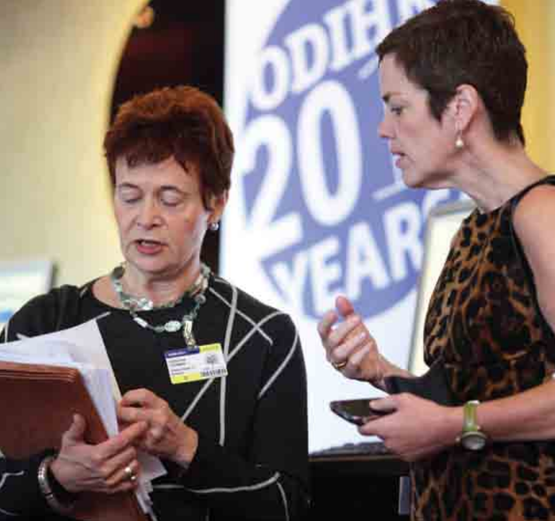
Participants at the annual OSCE Human Dimension Implementation Meeting, Warsaw, 26 September 2011.

leadership and women candidates, in co-operation with the OSCE Office in Yerevan, to promote women as party candidates in the run-up to parliamentary elections in Armenia in 2012.