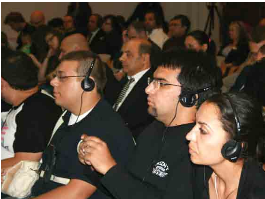
Participants from the Roma Youth Network TERNYPE at the ODIHR organized seminar “The Roma and Sinti Genocide: Memory, Identity and Present-day Racism”, 1 August 2011, Krakow, Poland.

Genocide: Memory, Identity and Present-day Racism” on 1 August in Krakow to provide a forum for discussions on the Roma genocide in Auschwitz-Birkenau and on ways to combat modern forms of racism and discrimination. The seminar was attended by historians, survivors and more than 90 young Roma from throughout Europe. As in the previous year, ODIHR put special emphasis on empowering Roma youth and supporting the Roma youth network Ternype. At the same event, ODIHR, in co-operation with the Council of Europe, launched a website dedicated to the Roma genocide ( http://www.romagenocide.org/ ). The website serves as a virtual library on the Roma genocide, providing information on publications, curricula, teaching materials, textbooks, places of remembrance and innovative practices introduced by government ministries, civil society, international organizations, museums and schools.