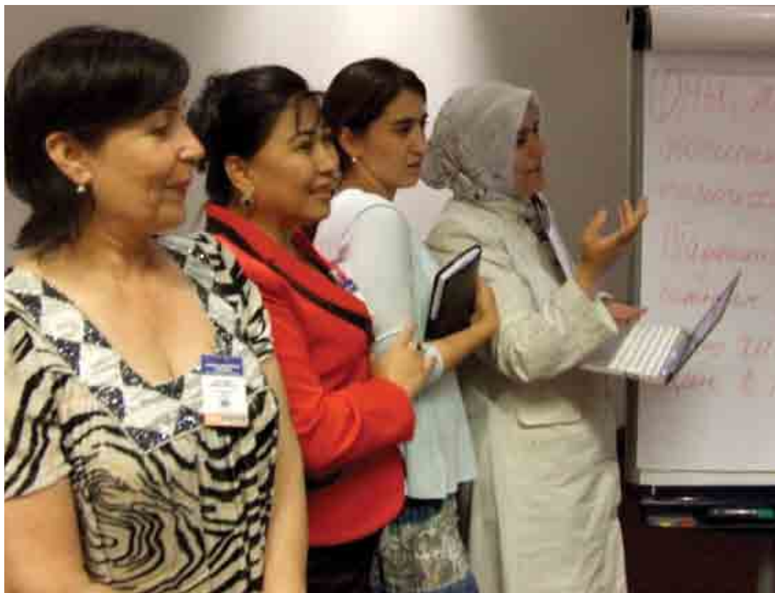
Women political party members from Tajikistan taking part in the Human Dimension Seminar on the Role of Political Parties in the Political Process, Warsaw, 19 May 2011.

the Office provided input to Tajikistan's draft national action plan, which was developed by the State Committee on Women and Family Affairs, in co-operation with women's organizations. ODIHR also provided legal opinions on the Law on Gender-Related Amendments and Addenda to Legal Acts of the Republic of Moldova, as well as on the Law on Equal Opportunities for Women and Men of the former Yugoslav Republic of Macedonia. In support of the latter, ODIHR contributed expertise to a working-group session on law amendments, on 14 July in Mavrovo. ODIHR also reviewed the new draft Law on Equal Opportunities for Women and Men drafted by the working group.