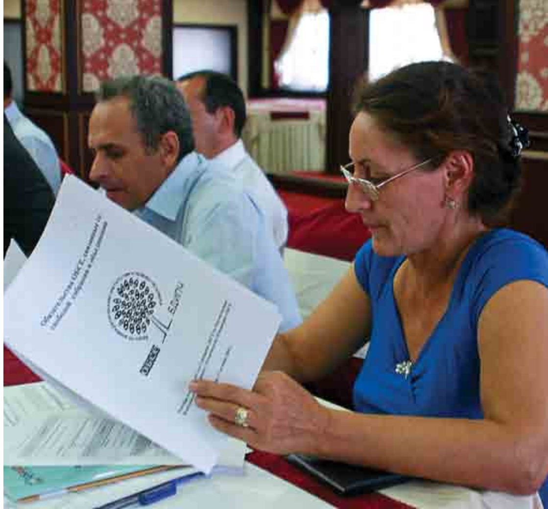
A participant at an ODIHR-supported training session for non-governmental organizations on international standards relating to freedom of association in the Nakhchivan Autonomous Republic, Azerbaijan, 5 September 2011.

this work includes supporting the establishment of more comprehensive and high-quality human rights education in schools and universities, as well as training for civil society and specialist groups, such as law enforcement officials and public health professionals.