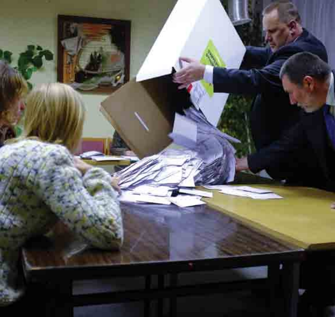
Counting begins at a polling station in Jurmala during Latvia's early parliamentary elections, 17 September 2011.

methodology, LEOMs are deployed to participating States where long-term observers are deemed necessary to ensure comprehensive regional coverage but election-day issues are expected to be unproblematic, or where fundamental shortcomings are so significant as to render election-day observation inconsequential.