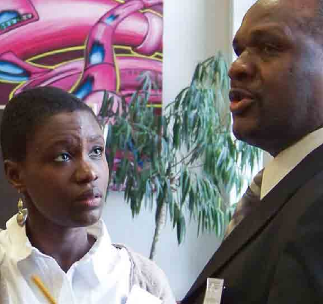
Participants at an ODIHR roundtable on contemporary forms of racism and xenophobia affecting people of African Descent in the OSCE region, Vienna, 10 November 2011.

monitoring the delivery and evaluating the impact of the training.