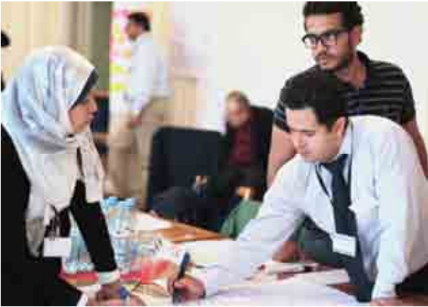
Participants in an OSCE/ODIHR workshop on election observation and human rights for Egyptian NGOs, Warsaw, 27 July 2011.

Election Department staff provided training at centres in a number of participating States: the German Centre for International Peace Operations (ZIF), the Norwegian Centre for Human Rights (NORDEM), the Russian Diplomatic Academy, the Austrian Study Center for Peace and Conflict Resolution (ASPR), the London-based Electoral Reform International Services (ERIS) and the Swedish International Development Cooperation Agency (SIDA), as well as at the European Commission's Network of Europeans for Electoral and Democracy Support (NEEDS).