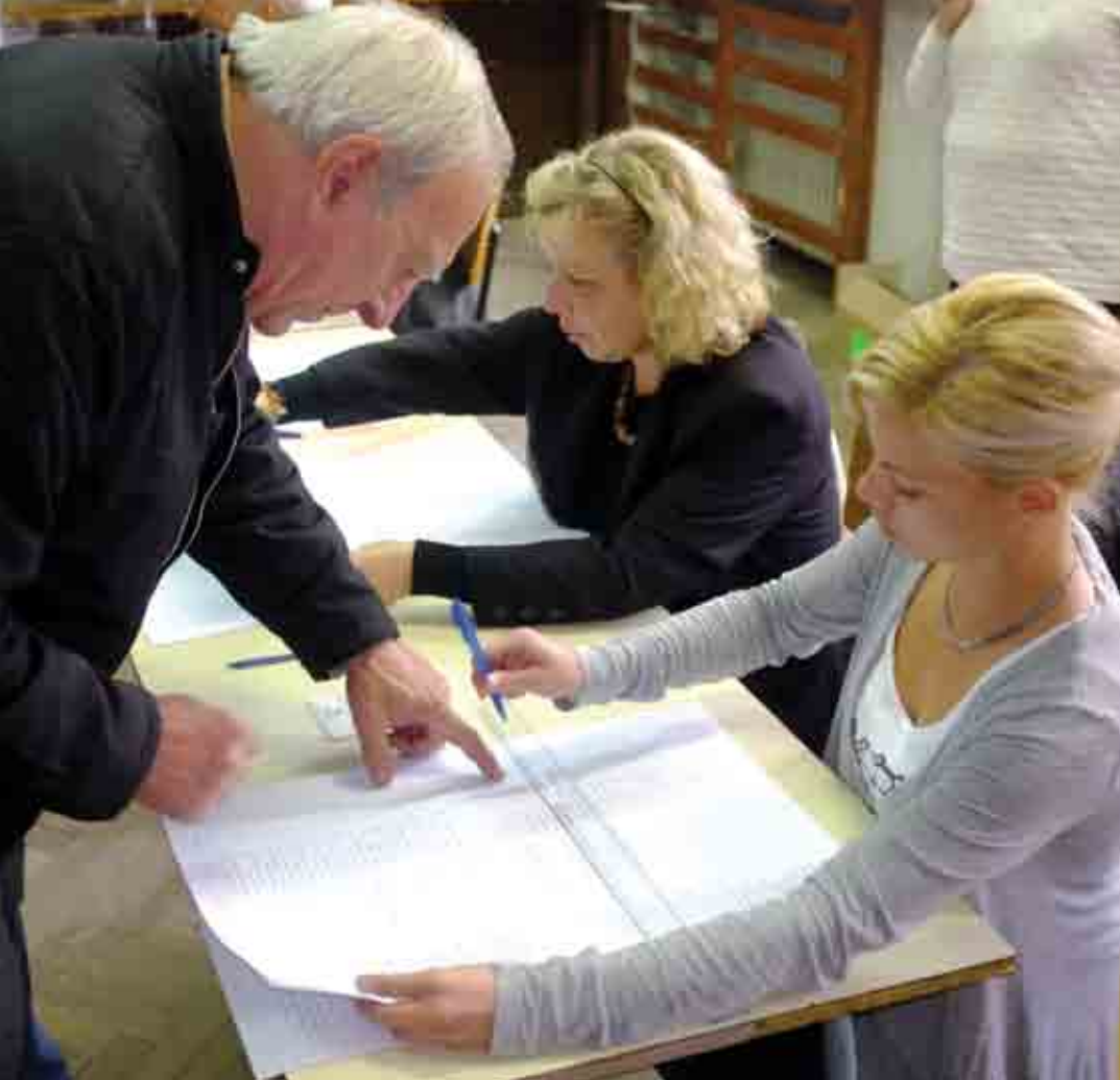
A voter identifying his name on the voter list during the presidential and municipal elections in Bulgaria, Sofia, 23 October 2011.