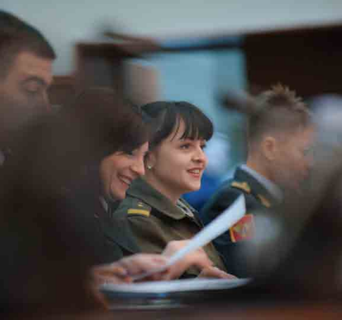
Participants at the first training seminar on UN Security Council Resolution 1325 on Women, Peace and Security held by the OSCE Mission to Moldova and ODIHR, Chişinău, 8 December 2011.

This is often preceded by inadequate victim identification and assistance, particularly in the context of labour trafficking. Without specialized legal assistance, victims are even more vulnerable to punishment and stigmatization by criminal justice actors and immigration officials. Furthermore, state authorities in many countries have failed to adopt comprehensive victim-centred support mechanisms and to reach out to vulnerable groups, such as undocumented migrants and other marginalized communities. Policies, practices and measures to guarantee the safe return of trafficked persons are still severely lacking throughout the OSCE region.