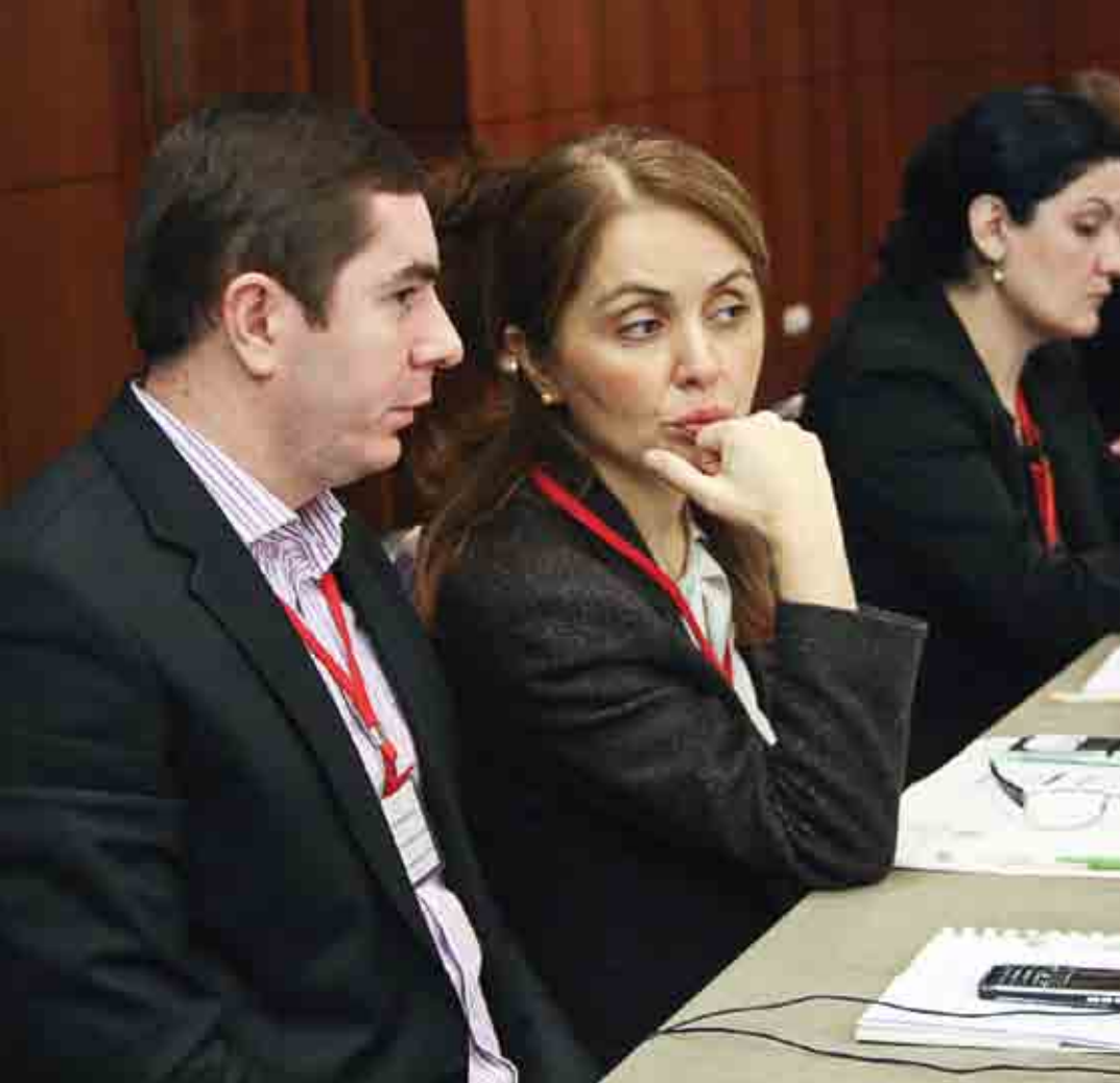
Participants at an ODIHR-supported roundtable on linkages between population registration and voter registration in Georgia, Tbilisi, 22 November 2011.

commitments, to address new challenges and socio-economic developments, to find new solutions to old problems, or as part of a regular process of monitoring existing laws. Legal reform is, therefore, a process that takes place in all countries.