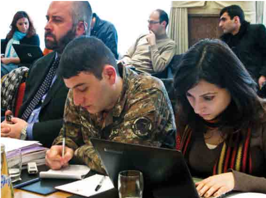
Participants at an OSCE-supported discussion on international best practices for democratic control of the armed forces and human rights protection in the military in Armenia, Yerevan, 22 February 2011.

Turkmenistani authorities, ODIHR, jointly with the OSCE Centre in Ashgabat, conducted a roundtable to present The Compendium of Good Practice in Human Rights Education in the School Systems of Europe, Central Asia and North America on 27 and 28 January in Ashgabat. ODIHR experts presented human rights education practices from the Compendium, with special focus on aspects of possible relevance for Turkmenistan. Twenty Turkmenistani participants — including representatives of the Ministry of Education, the National Institute of Education, the National Institute for Democracy and Human Rights, Turkmen State University, the Pedagogical Institute and the Institute for International Relations — discussed the practices and their possible implementation in Turkmenistan.