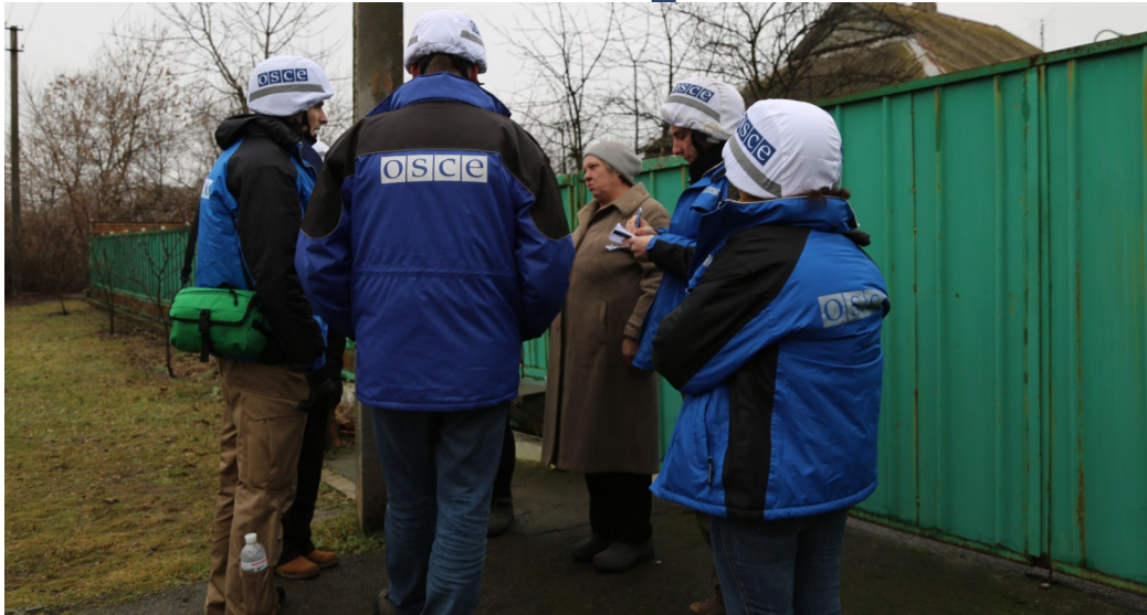
OSCE SMM on patrol in Travneve, 15 December 2017.