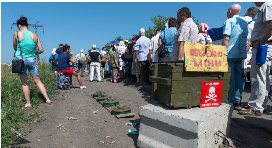
Anti-tank mines close to people queuing at Ukrainian Armed Forces checkpoint near Marinka, 22 June 2016