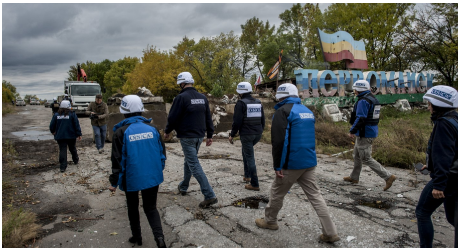
OSCE SMM monitors patrolling Zolote-Pervomaisk area, Luhansk region, 26 September 2016.