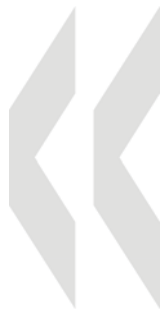
Working Group on Bribery December 2011