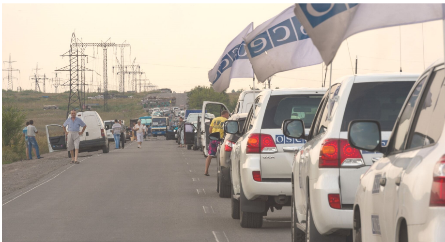
People queuing at the entry-exit crossing point near Marinka, Donetsk region, 2 August 2016.