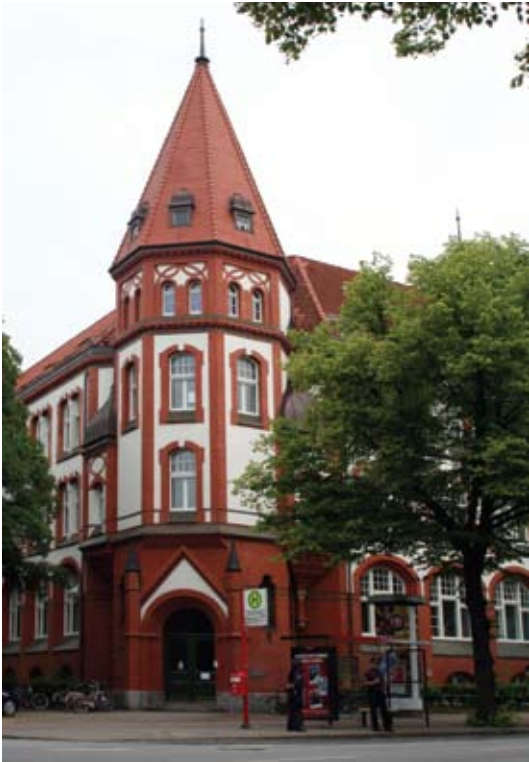
The Centre for OSCE Research (CORE) is part of the Institute for Peace Research and Security Policy in Hamburg, Germany.