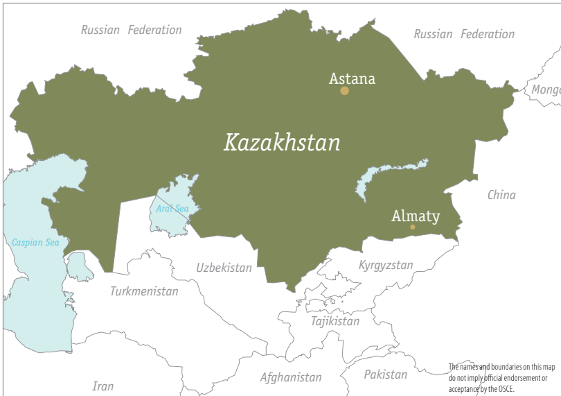
MAP: OSCE MAGAZINE/NOVA REUTER