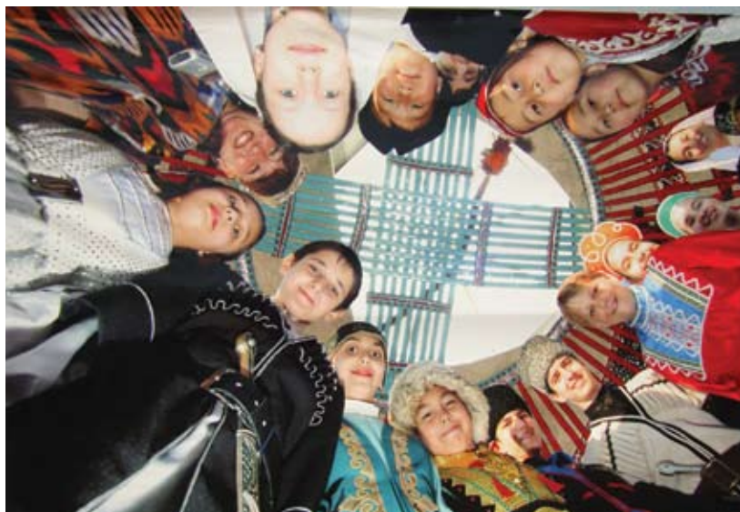
OSCE FOREIGN MINISTRY OF KAZAKHSTAN

The OSCE’s broad geographical coverage in its membership, its multilateral approach to stability and security, and the consensus principle employed in decision-making are features that add to our Organization’s uniqueness.