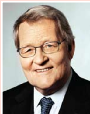
CENTRE OF PUBLIC DIPLOMACY DANISH MFA

Flavio Cotti, OSCE Chairman-in-Office. Head of the Swiss Federal Department of Foreign Affairs (1994-1999). President of the Swiss Confederation (1991 and 1998).