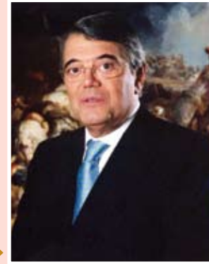
OSCE/PORTUGUESE FOREIGN MINISTRY

Jaime Gama, OSCE Chairman-in-Office (1 January-6 April 2002). Foreign Minister (1983-1985 and 1995-2002). President of Portugal since 2005.