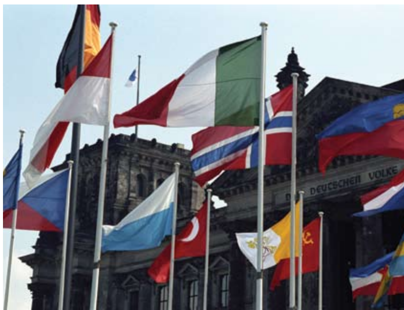
19 June 1991, Berlin. The Reichstag at the opening of the first meeting of the CSCE foreign ministers