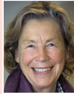
JARL HJALMARSON FOUNDATION

Jozef Moravčík, CSCE Chairman-in-Office (3 July-31 December 1992). Last Foreign Minister of Czechoslovakia (July-December 1992). Foreign Minister of the newly formed Republic of Slovakia (March 1993-March 1994). Prime Minister of Slovakia (March-December 1994). Mayor of Bratislava (1998-2002).