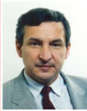
CZECH FOREIGN MINISTRY

Jiří Dienstbier, CSCE Chairman-in-Office (1 January-2 July 1992). Foreign Minister and Deputy Prime Minister of Czechoslovakia (1989-1992). Special Rapporteur of the United Nations Commission on Human Rights on the situation of human rights in Bosnia and Herzegovina, the Republic of Croatia and the Federal Republic of Yugoslavia (1998-2001). Member of the Czech Senate since 2008.