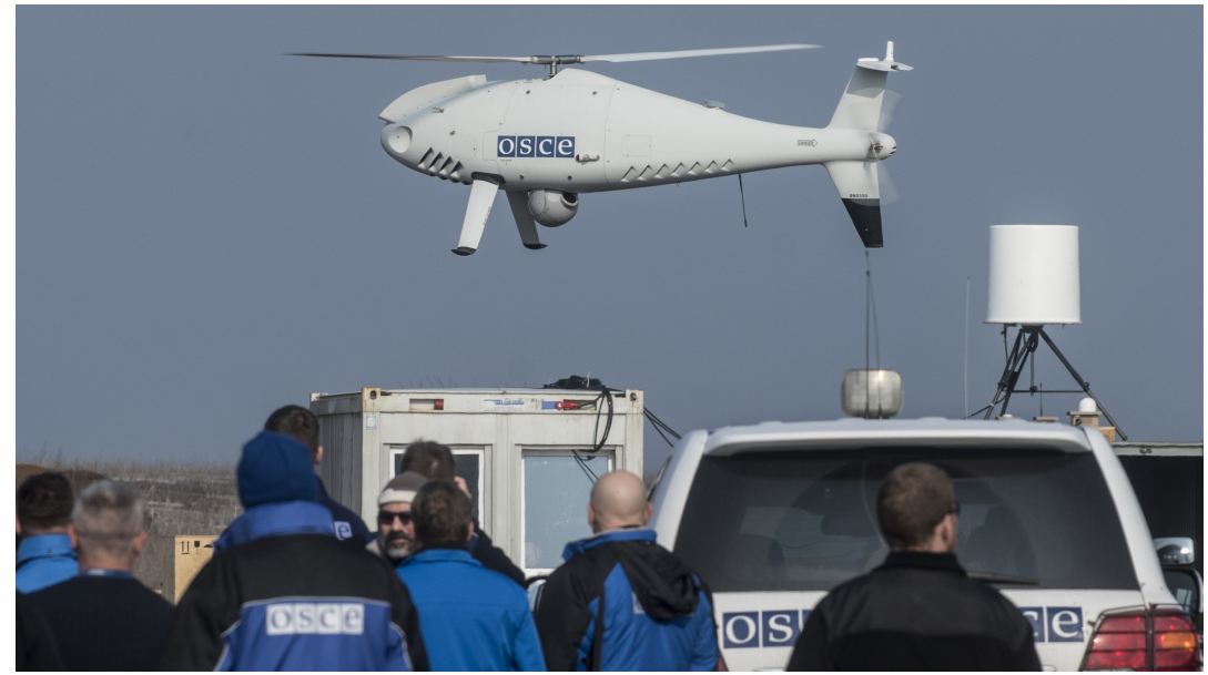
The OSCE SMM launching the long-range unmanned aerial vehicle near Kostiantynivka in Donetsk region, 28 March.