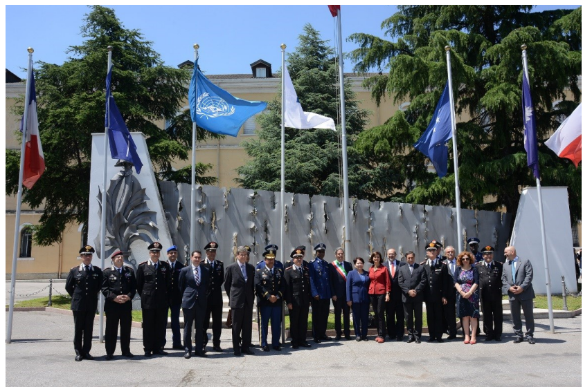
High-level authorities participating in the launch event