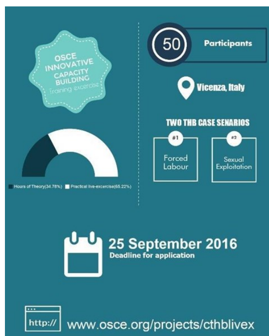
Chart posted on Twitter to share the call for participants