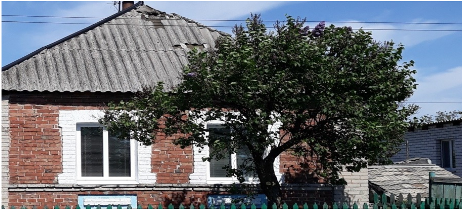
A shell-damaged civilian house in Avdiivka, Donetsk region