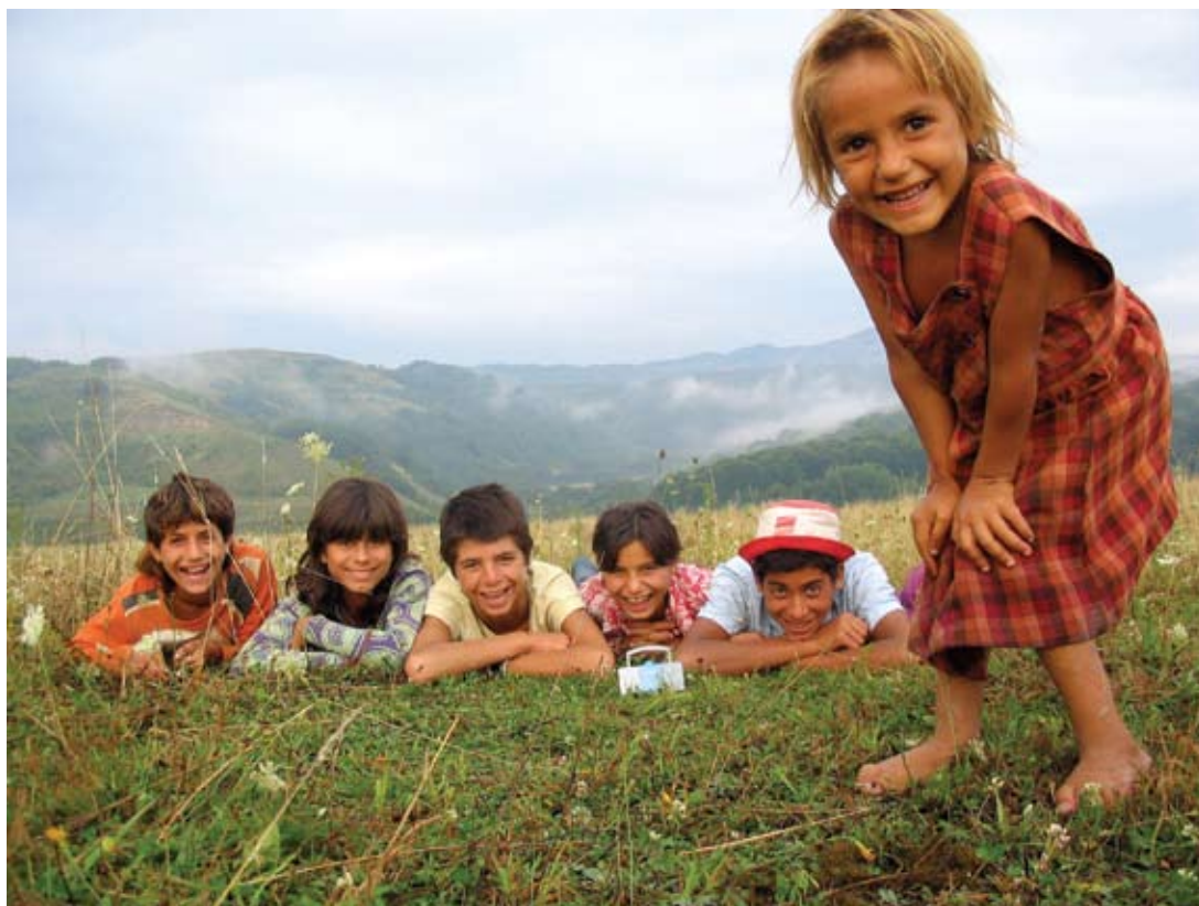
Action plan on Roma: Keeping track of progress (page 14). Photo: "Children of the Hills" by Zoltan Krisztian Bereczki, Romania

Organization for Security and Co-operation in Europe