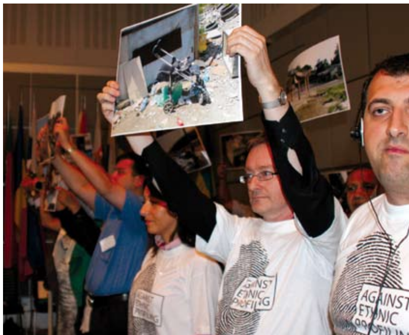
Vienna, 10 July. Activists protest against ethnic profiling in connection with the Italian Government's plans to fingerprint Roma and Sinti living in camps in Italy. The opportunity to make their views known arose during a meeting organized by ODIHR to discuss the role of local authorities in integrating Roma into the social fabric.