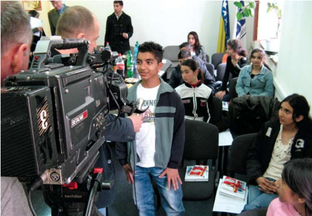
OSCE Mission to Bosnia and Herzegovina, Regional Centre in Tuzla, 2007. Outstanding Roma students are interviewed on FTV (Federal BiH Television) on International Roma Day (8 April).