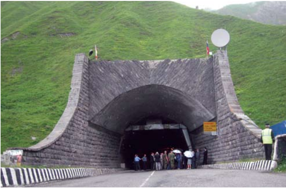
Roki Tunnel connecting South Ossetia and North Ossetia, 8 July. The OSCE delegation of ambassadors and representatives visited the zone of conflict for two consecutive days and met South Ossetian leaders.