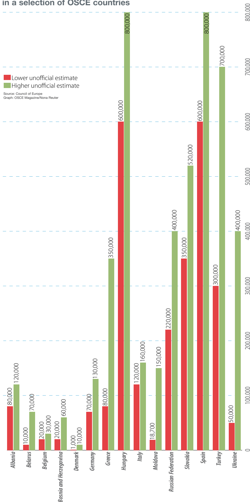
Estimated (unofficial) Roma and Sinti populations in a selection of OSCE countries

Whether their total number is closer to 8 million or 12 million, Roma and Sinti and other groups such as Travellers and Gypsies make up the largest minority population in the OSCE area. Comprising a rich and diverse palette of ethnic, linguistic and cultural communities, they are believed to have migrated from the Indian subcontinent between the ninth and fourteenth centuries. Because of their long history of persecution and personal experience of blatant discrimination or outright hatred, many Roma have been reluctant to declare their ethnic identity. This is reflected in the wide disparities in unofficial estimates of the Roma population in a sample of OSCE countries. Romania, not included in the graph below, has the largest Roma and Sinti community, estimated at between 1.2 million and 2.5 million.